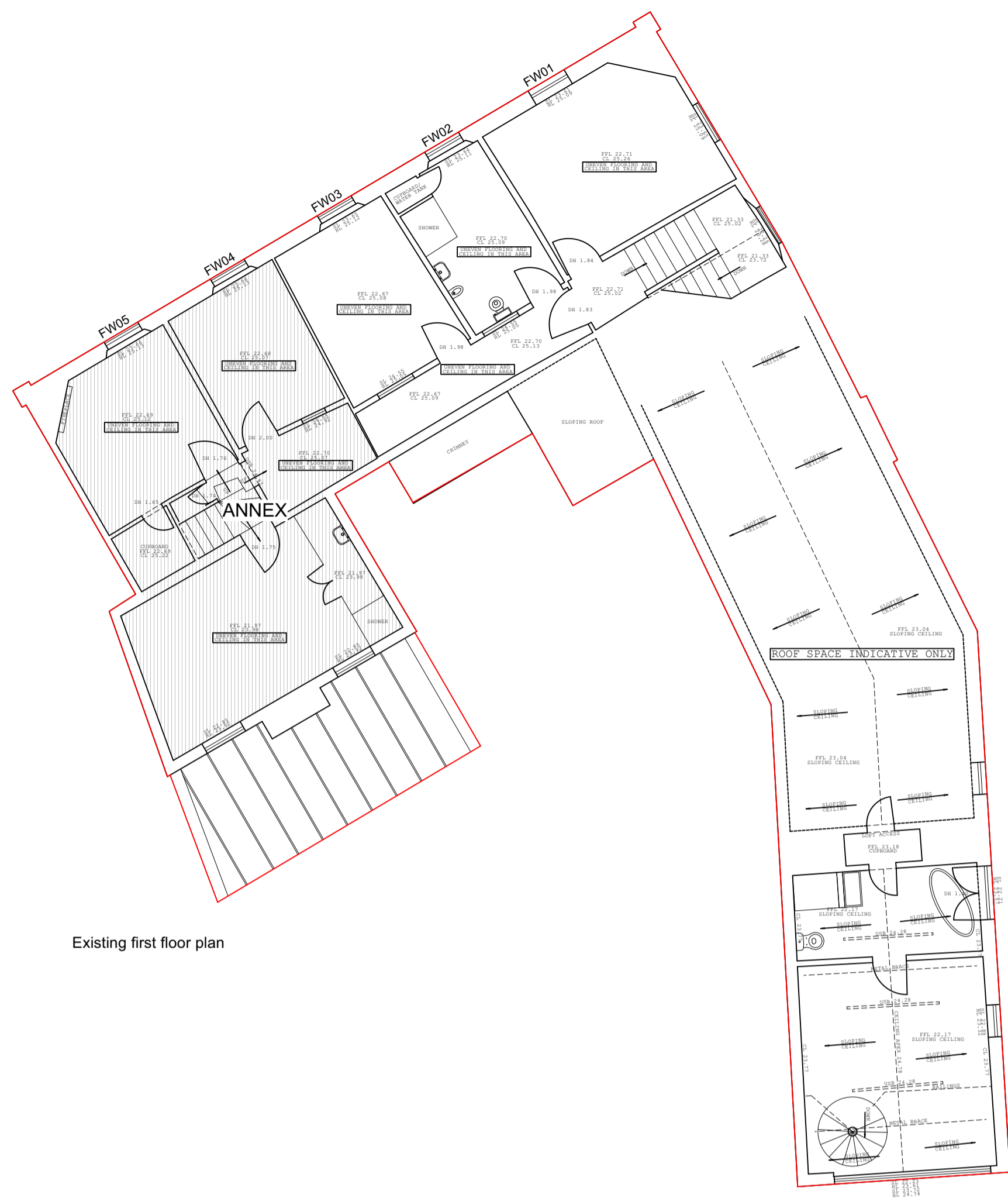
Existing first floor plan