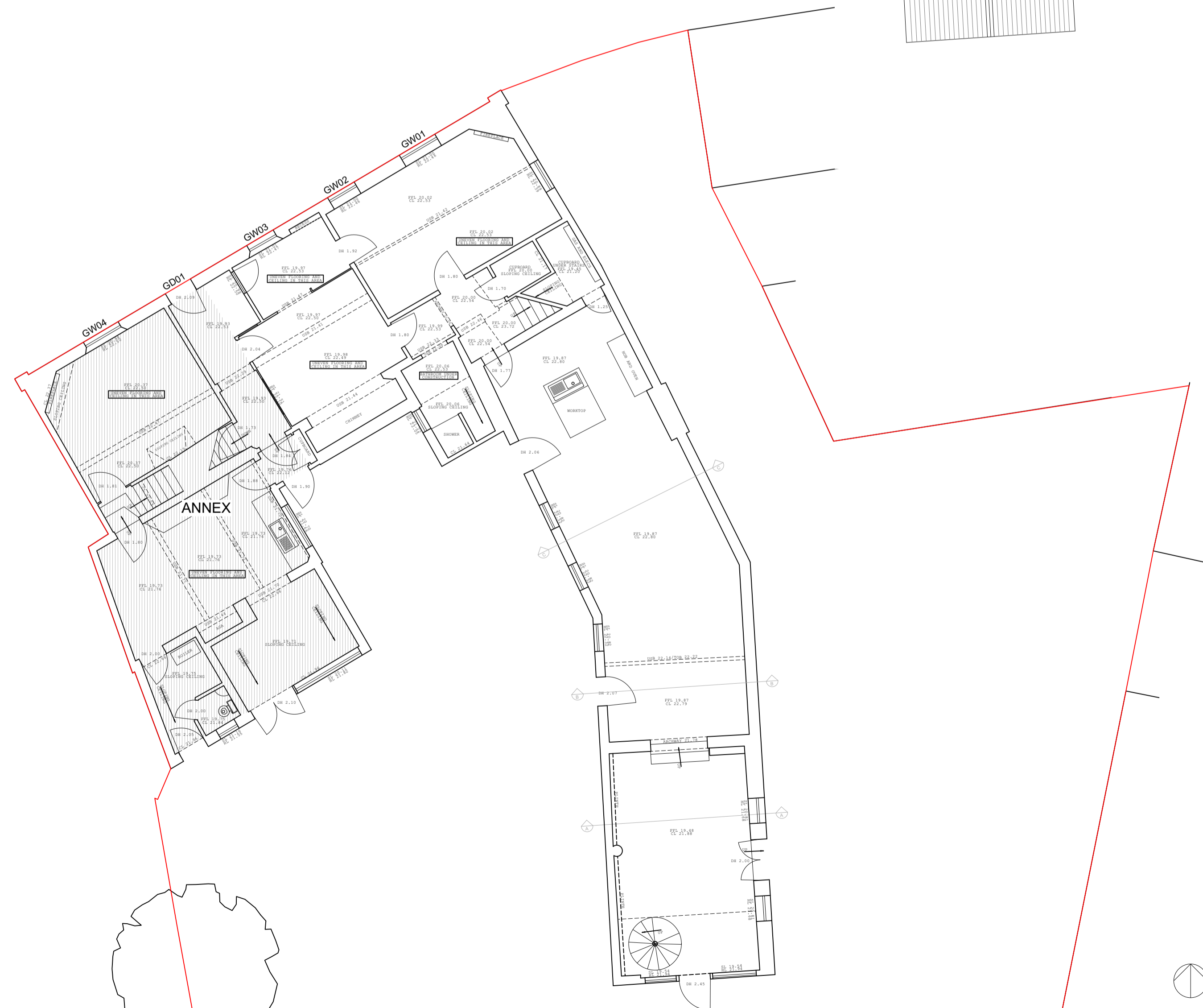
Existing ground floor plan