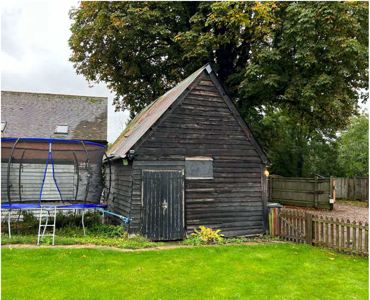
Photographic plate showing existing timber barn and T1 to rear of barn. (ROAVR, October 2023)