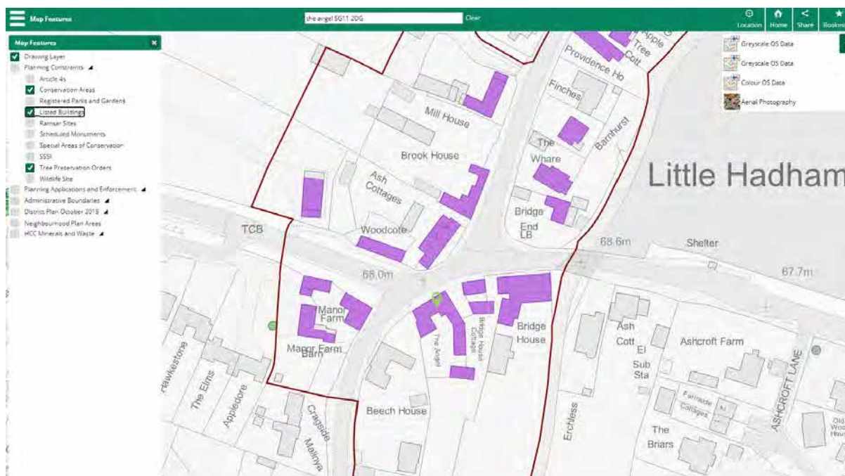
Image plate showing the desktop analysis results of the surveyed plot. (East Herts D, 2023)

https://ehdc.cloud.cadcorp.com/ehdc_WebmapPublic/Map.aspx?mapName=Planning