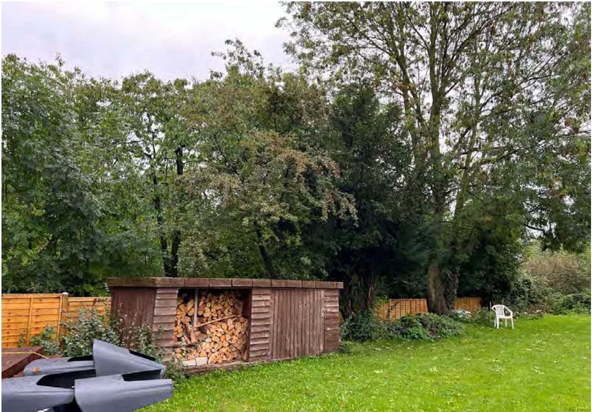
Photographic plate showing T2-T8 (ROAVR, October 2023)