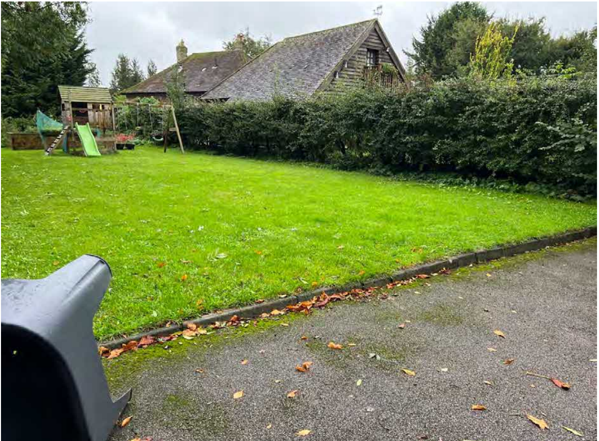
Photographic plate showing proposed location of barn (ROAVR, October 2023)