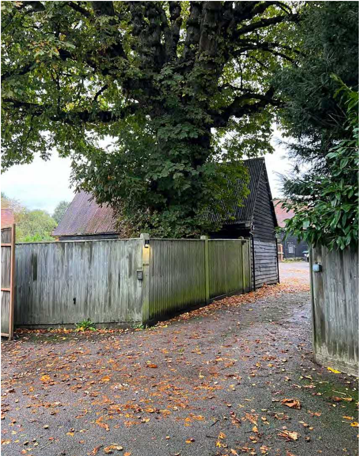
Photographic plate showing T1 and surrounding hard surfaces (ROAVR, October 2023)