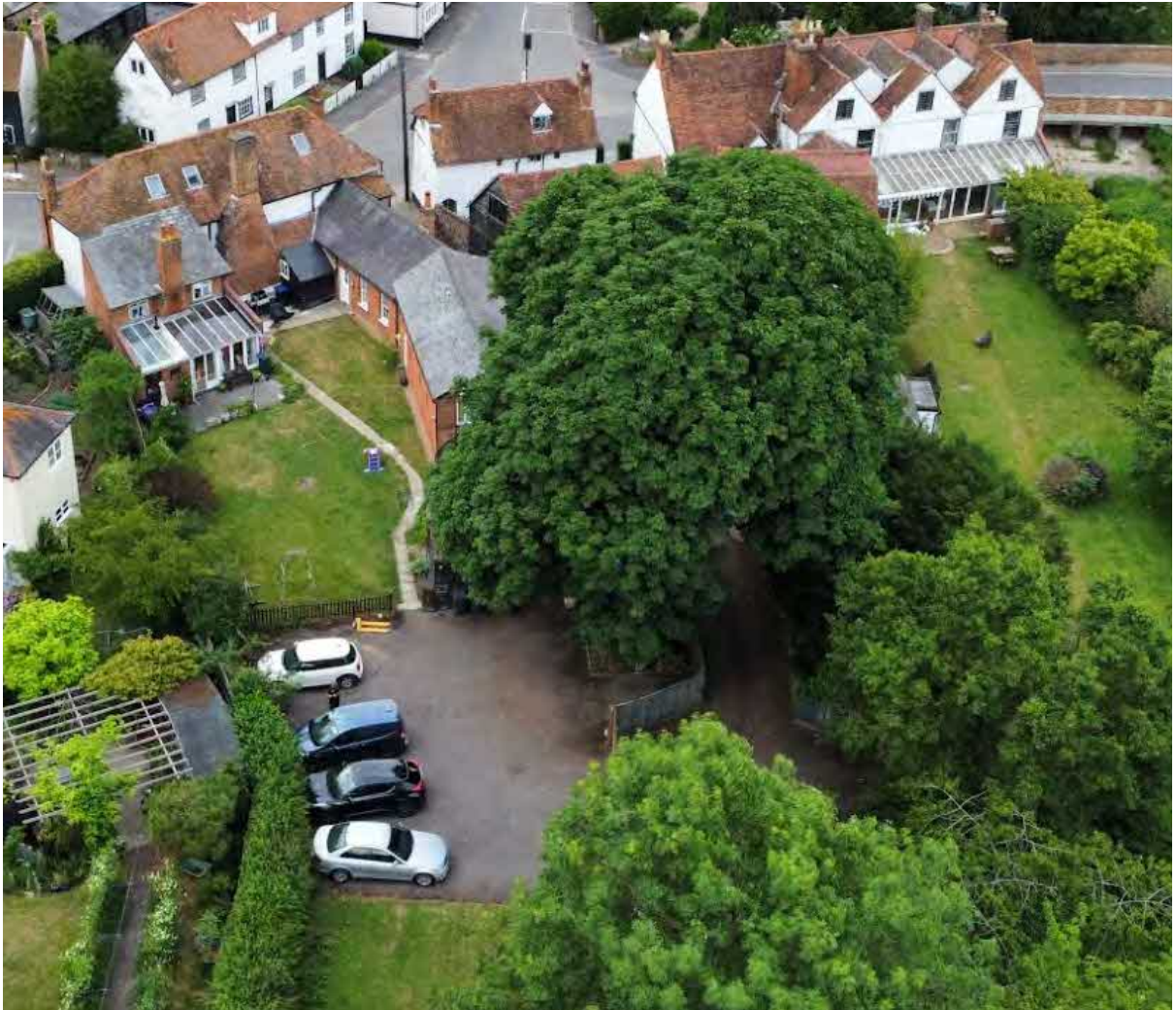
Aerial im age plate showing site layout, T1(centre) and of her tree cover to the south.