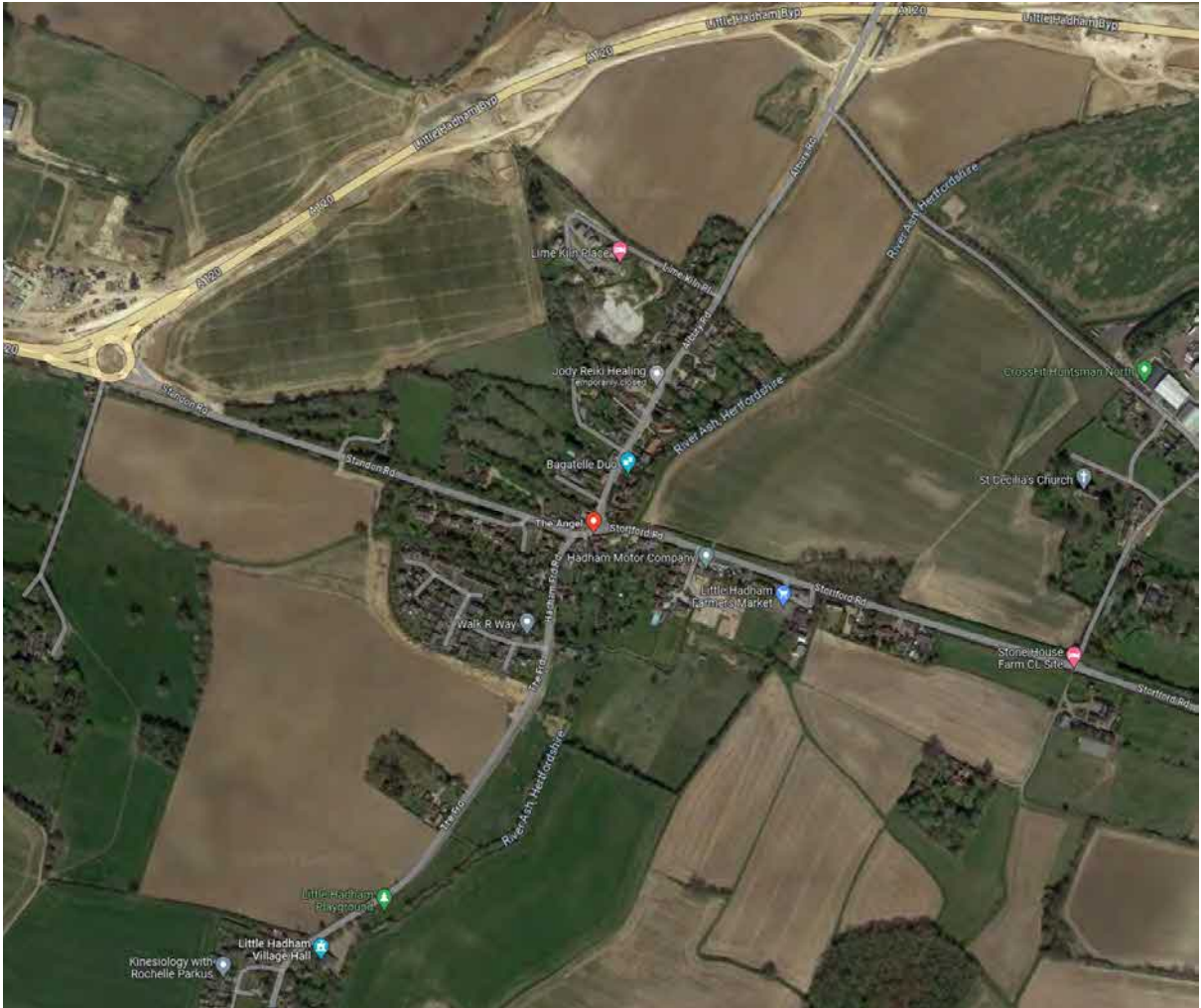
Site location plan.