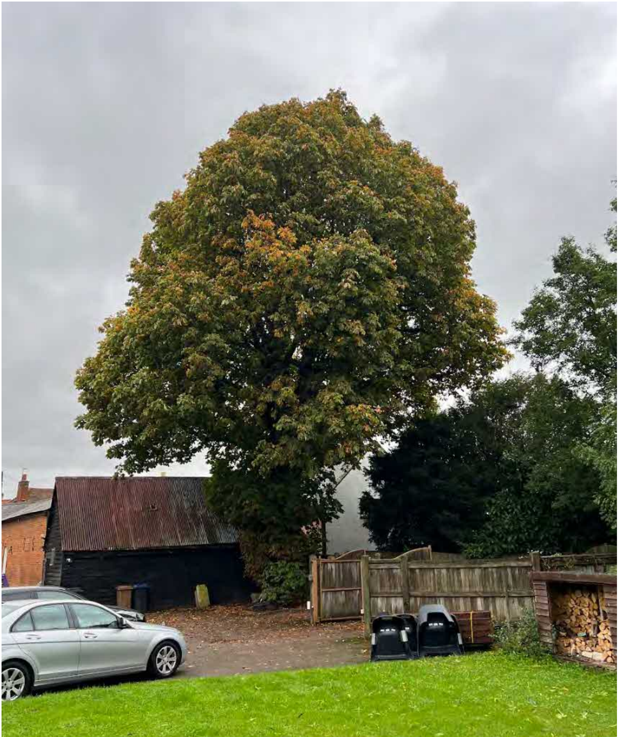
Photographic plate showing existing timber barn and T1 to the right of barn. (ROAVR, October 2023)