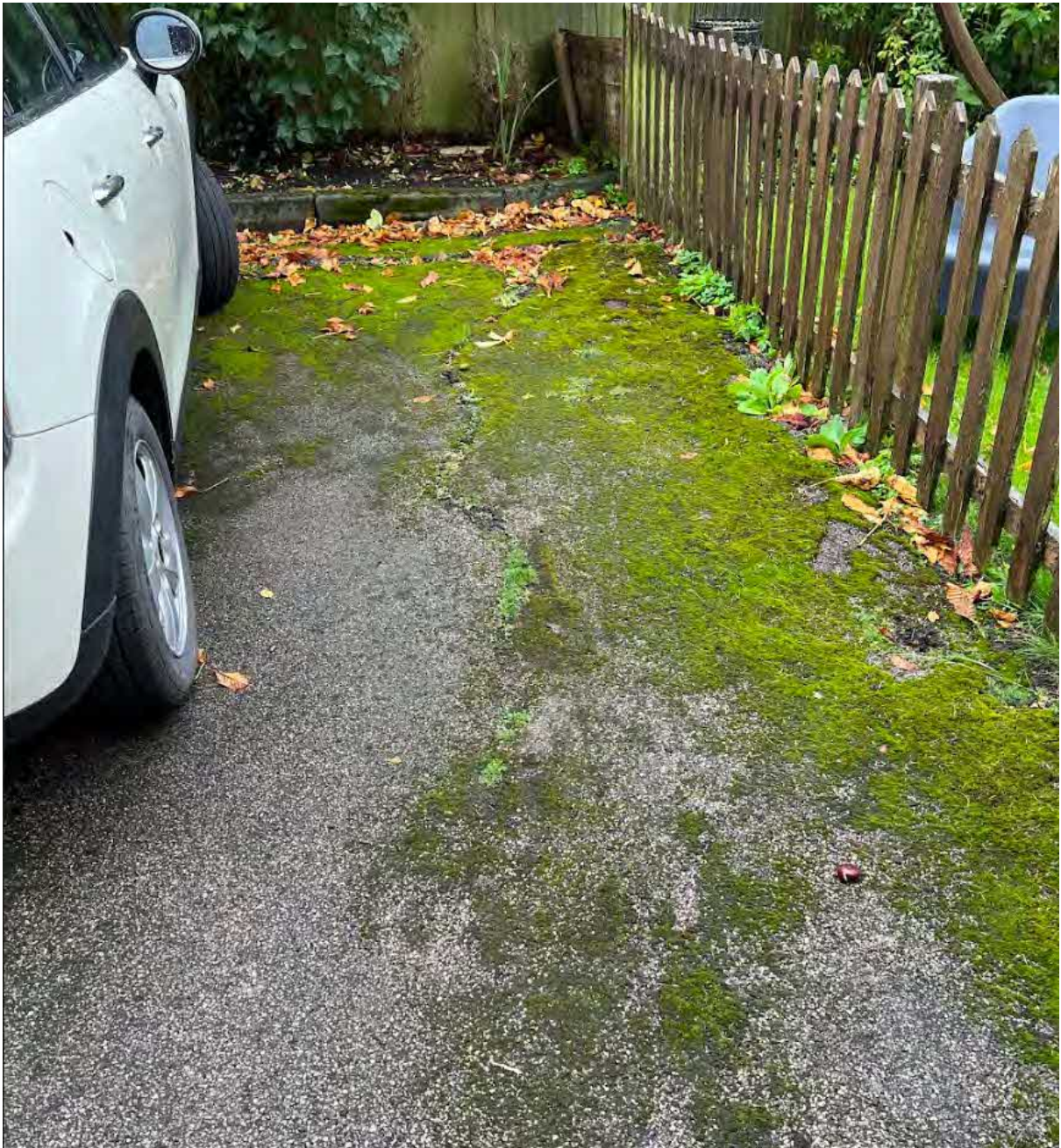
Photographic plate showing cracks in existing hard surfaces within RPA of T1 (ROAVR, October 2023)