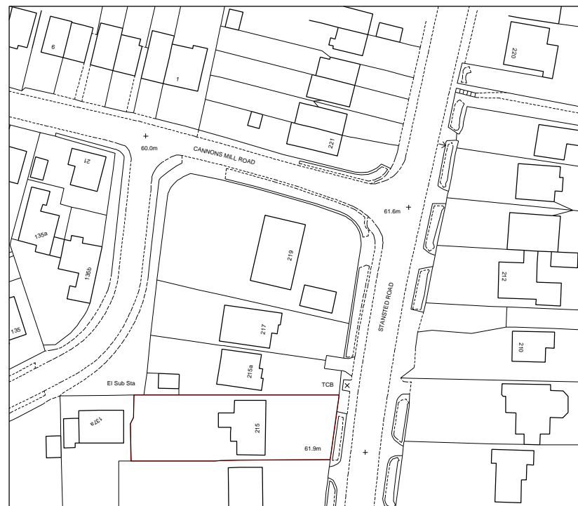
Location Plan scale 1:1250