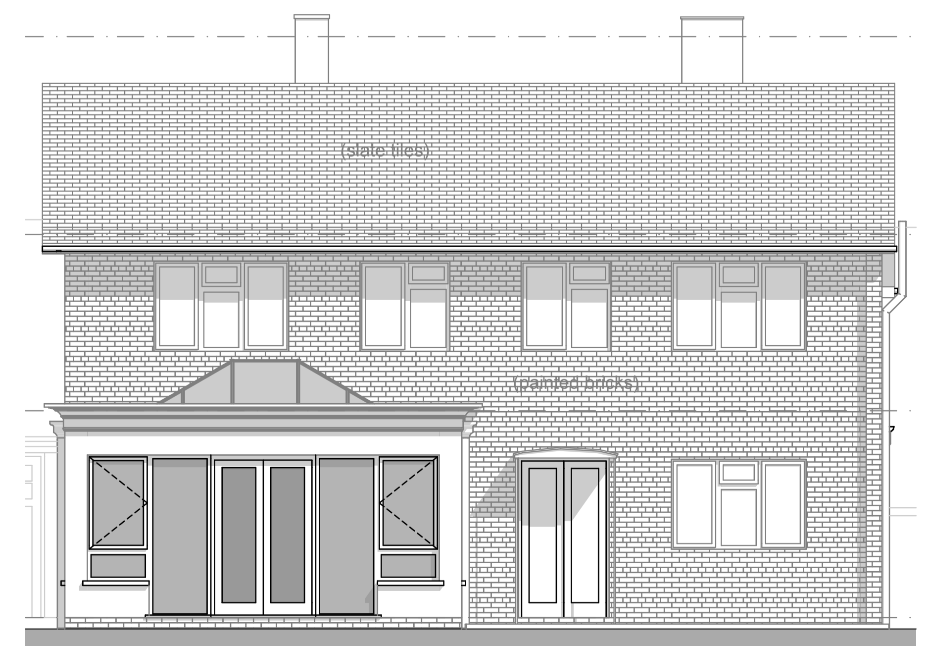
South Elevation - Proposed 1:50