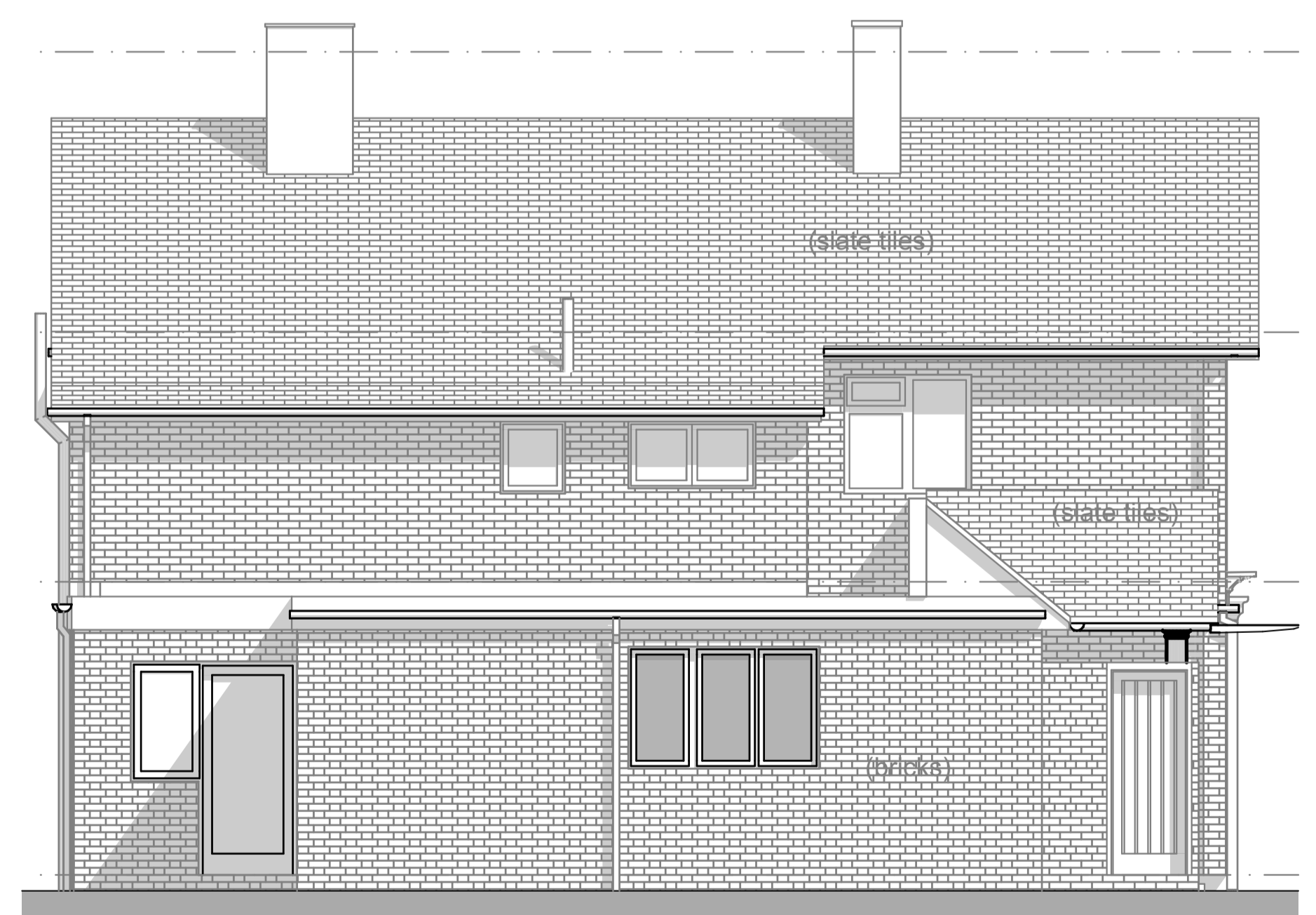
North Elevation - Proposed 1:50