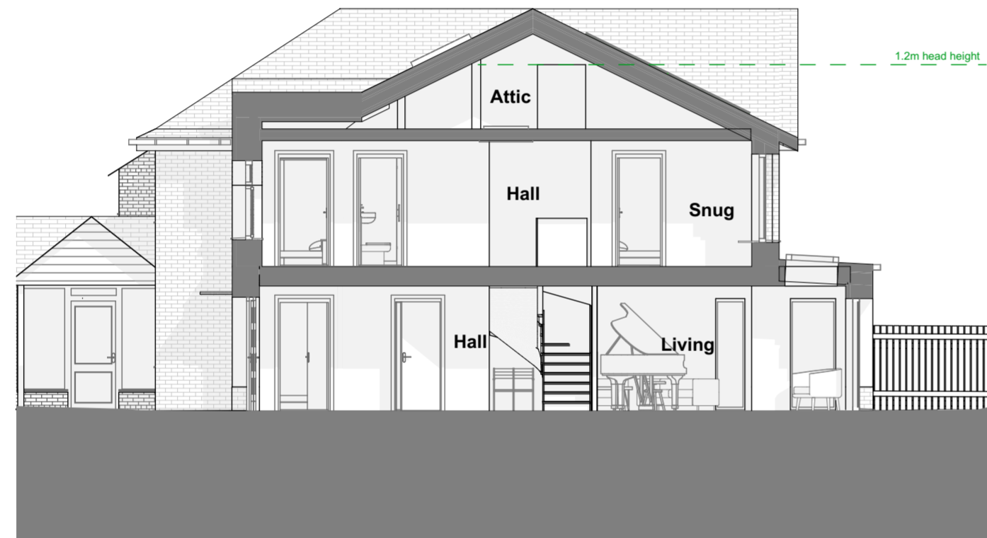
A Typical Cross Section 1:100

ALL STRUCTURAL STEEL & TIMBER SIZES TO BE IN LINE WITH STRUCTURAL ENGINEERS LAYOUTS