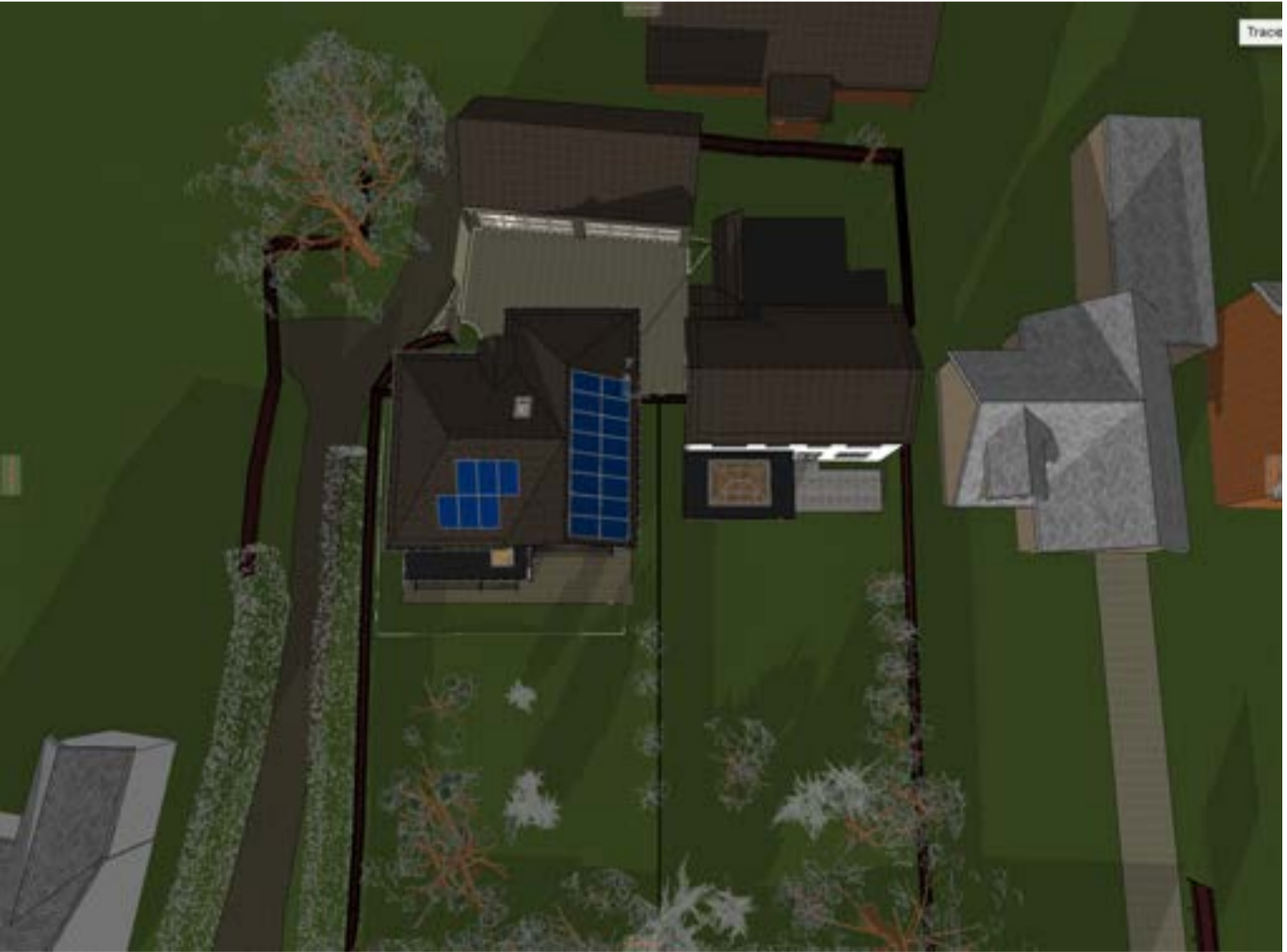
Proposal on Winter Solstice 12pm