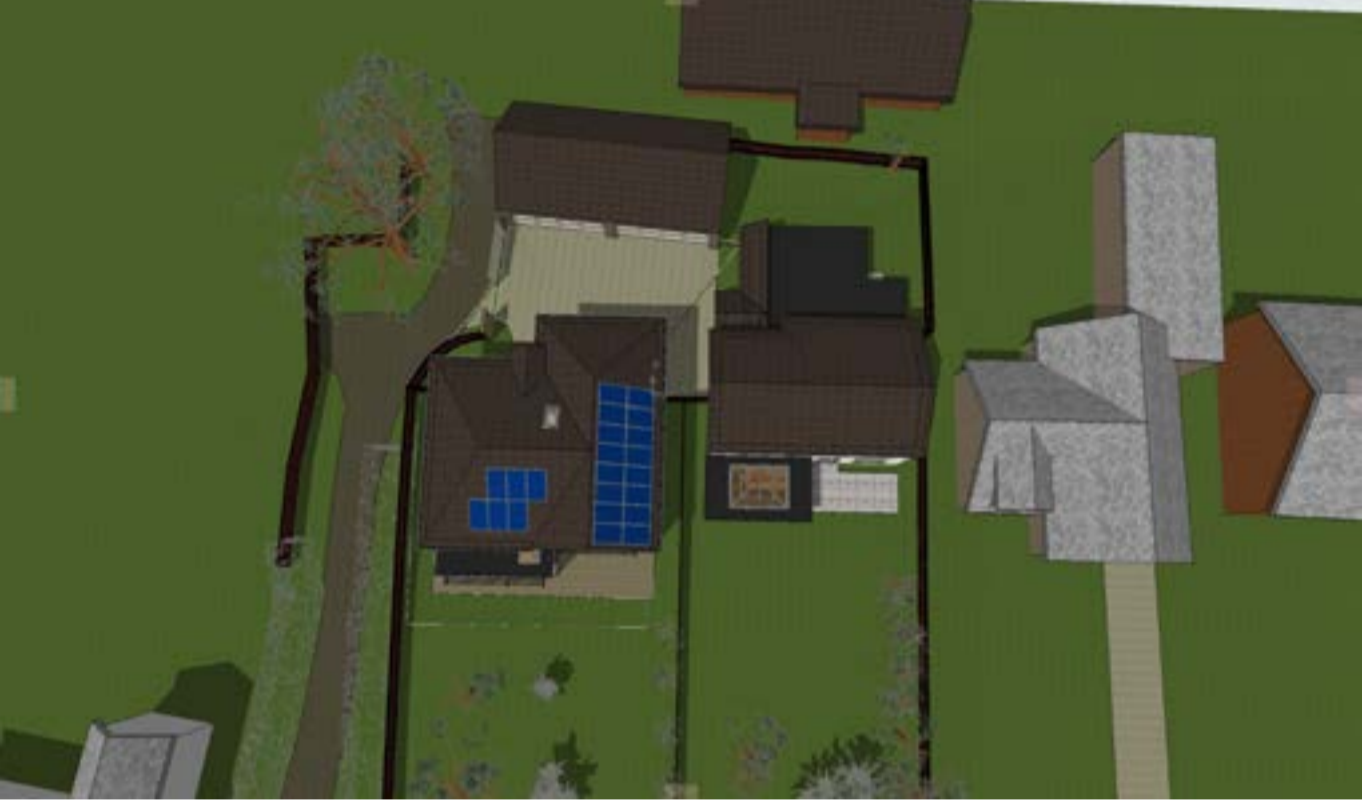
Proposal on Summer Solstice 12pm