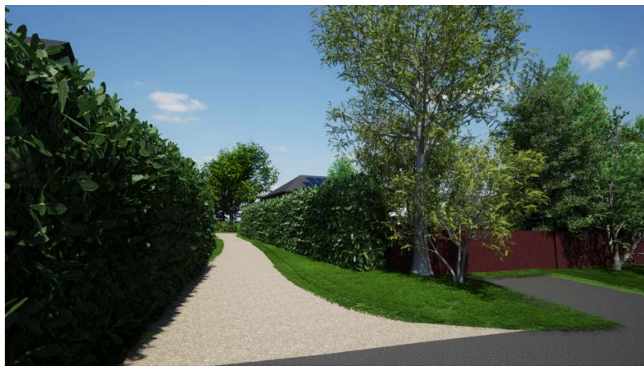
View Down Private Road