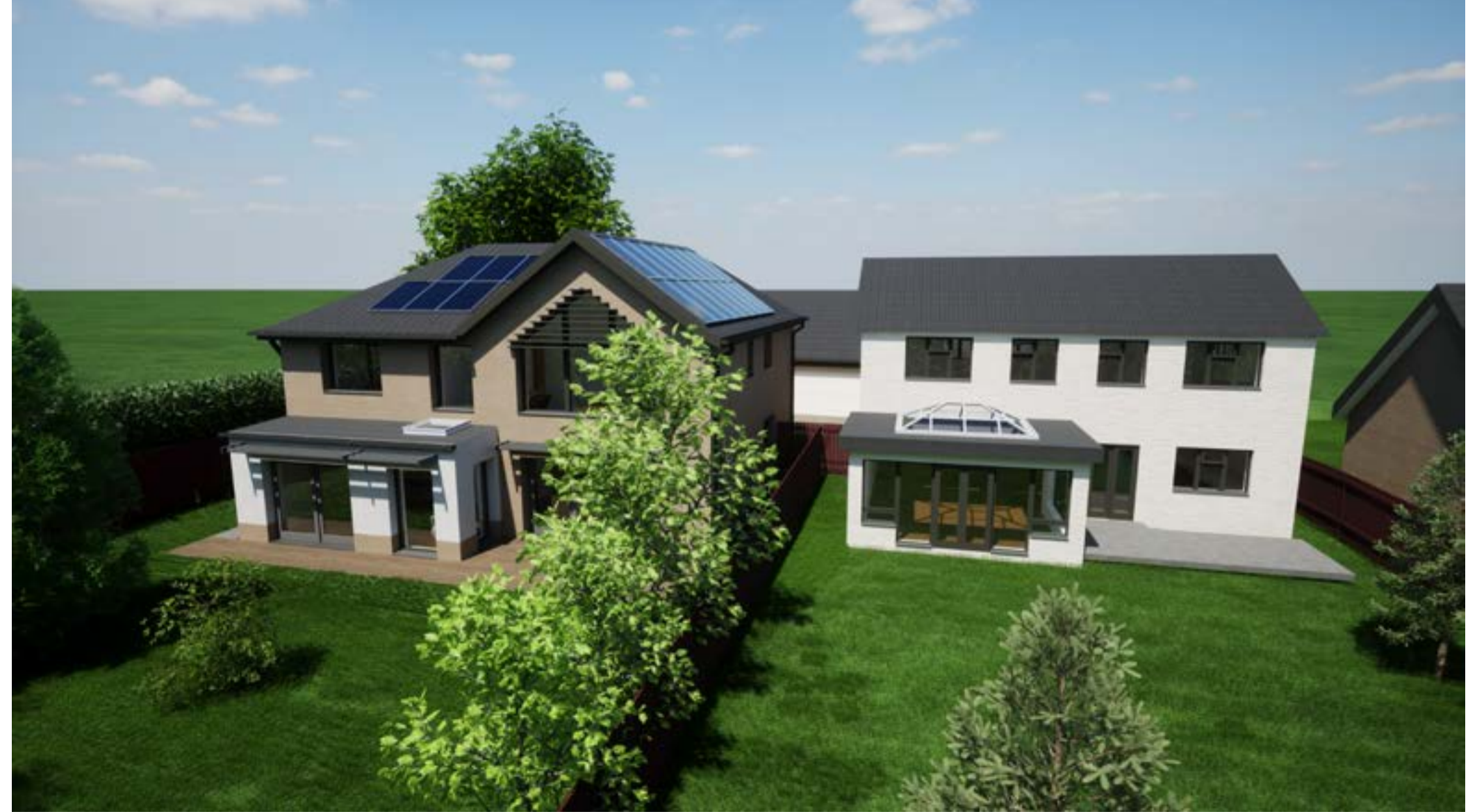
Donor Dwelling and Proposed Dwelling South Elevations