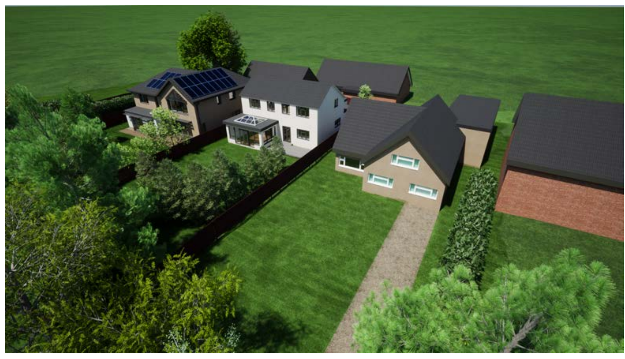
Birdseye View of Site and East Neighbour