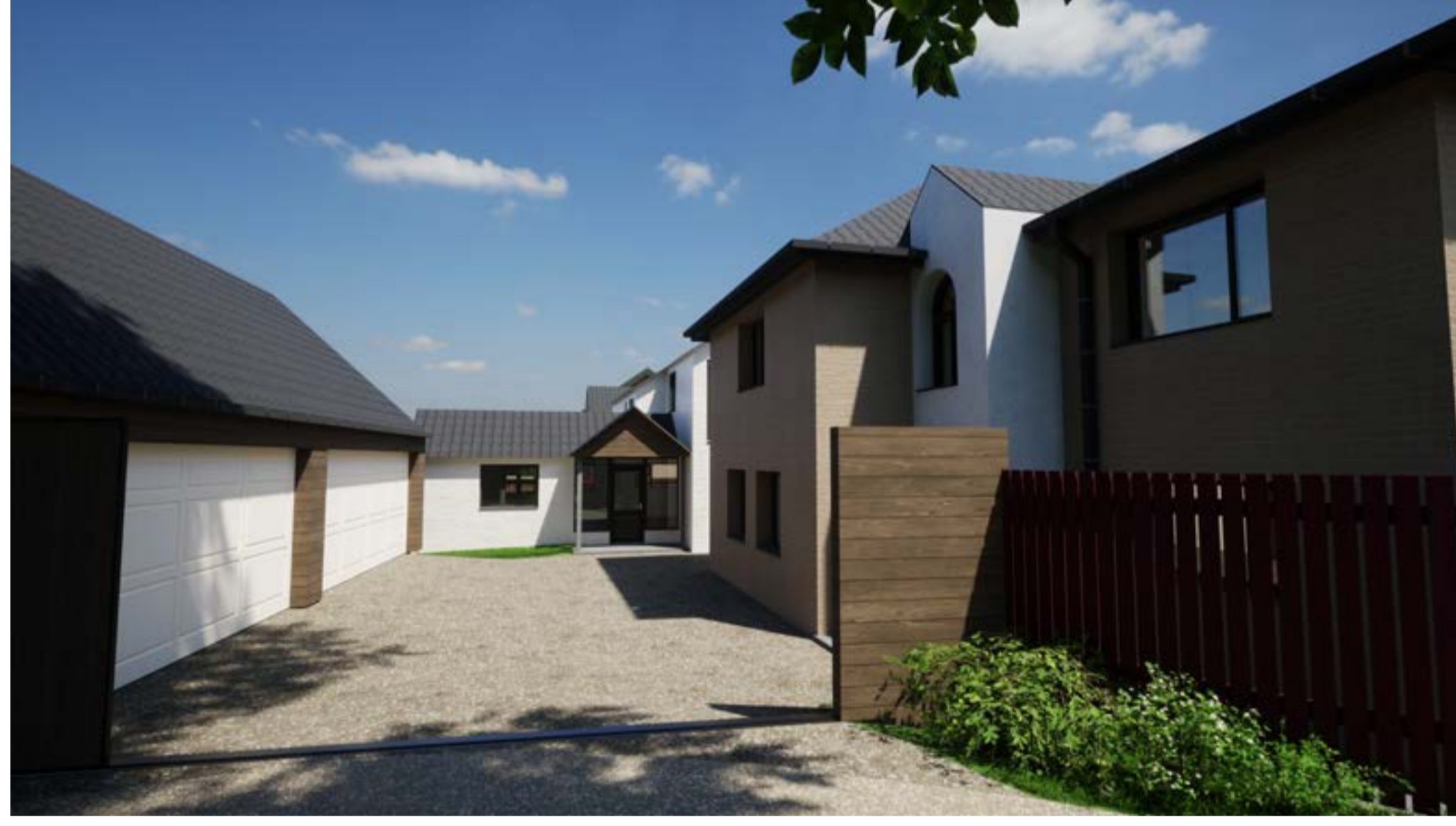
Shared Drive and Dwelling Entrances (Gate Open)