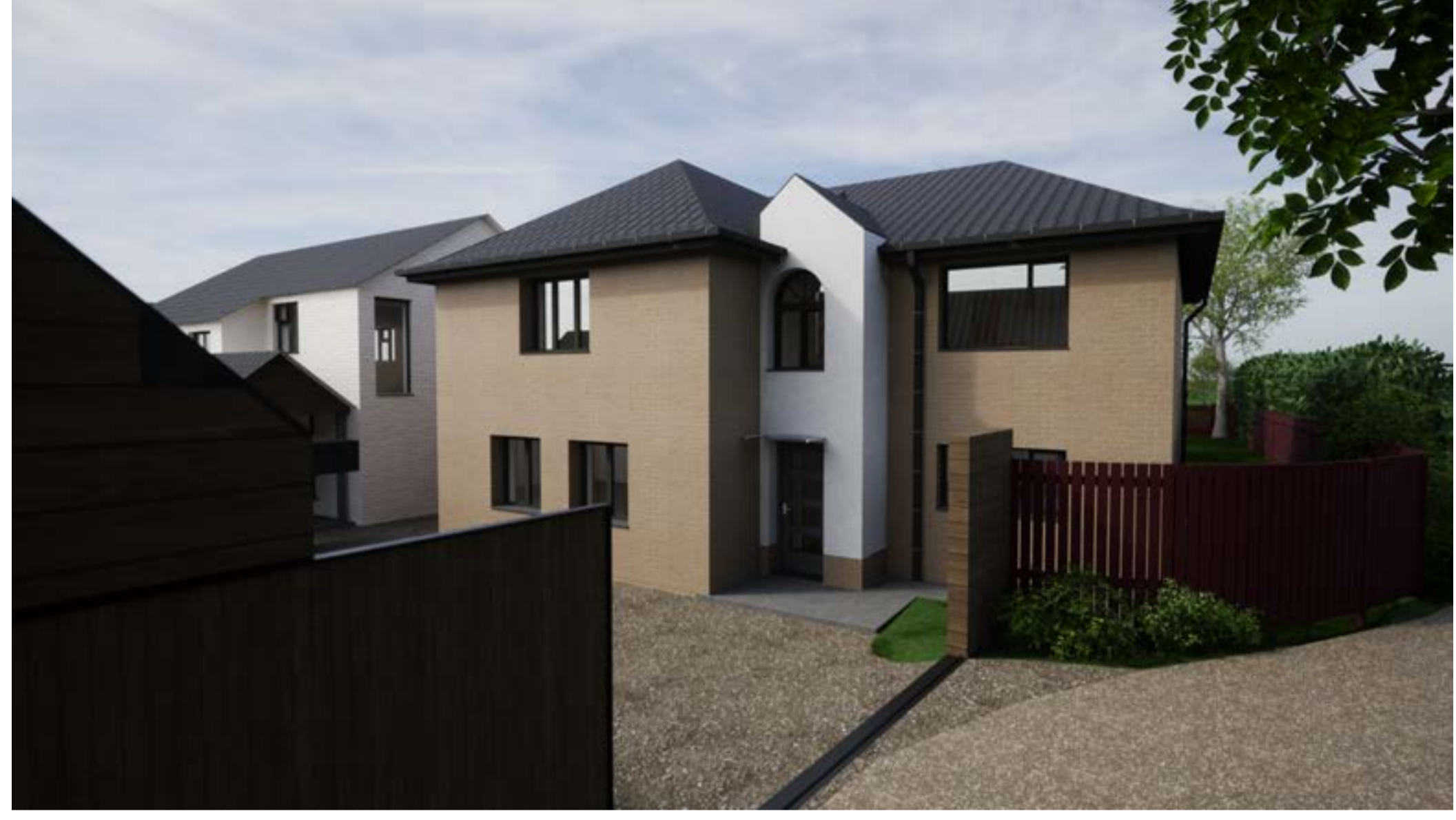
Proposed Dwelling Entrance (Gate Open)