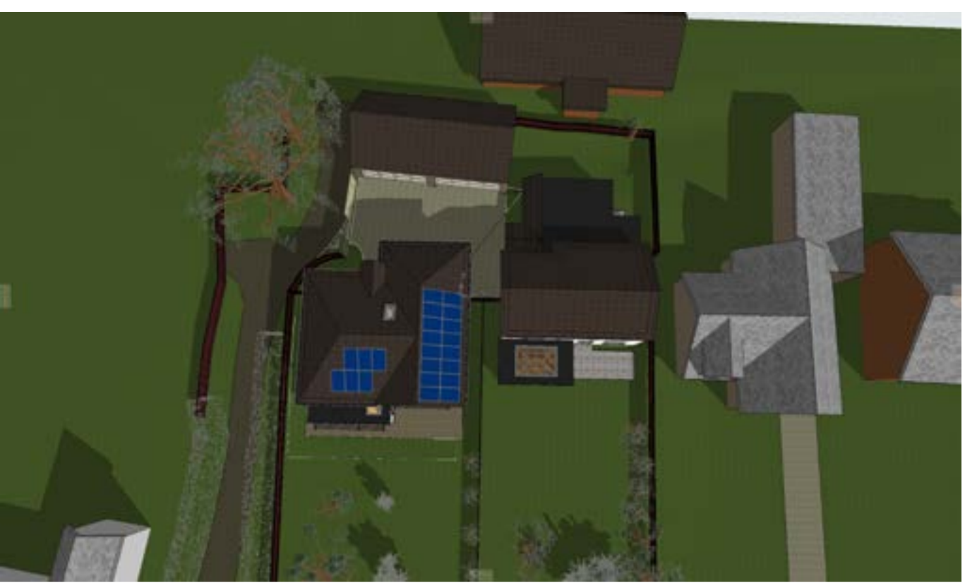
Proposal on Summer Solstice 8am