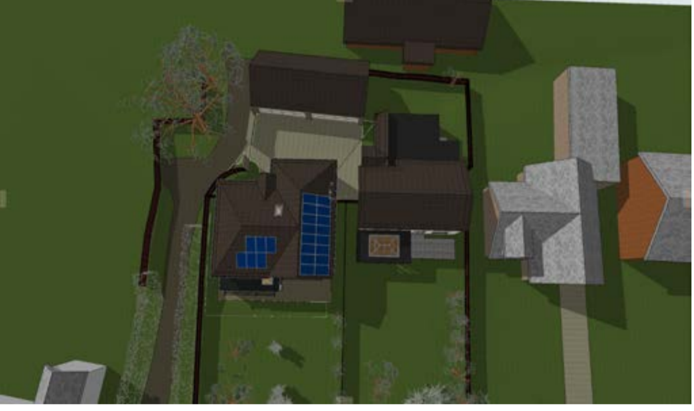
Proposal on Summer Solstice 4pm