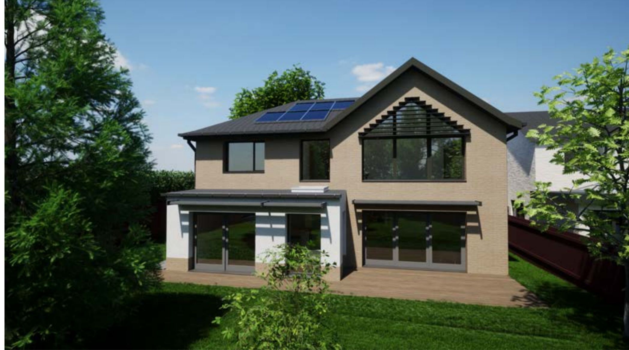
Proposed Dwelling South Elevation