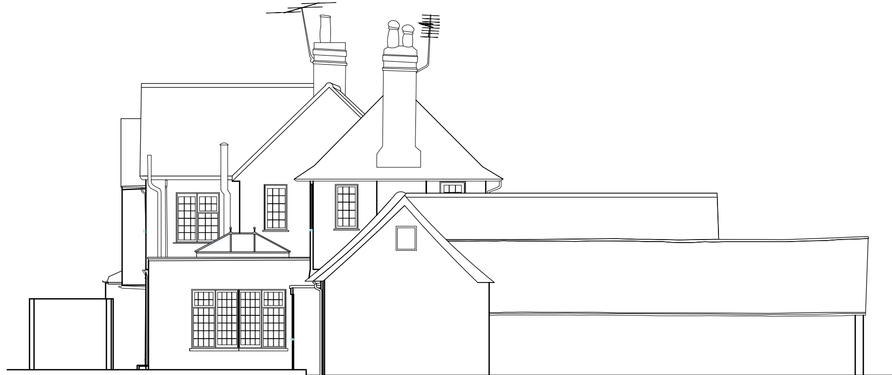
EXISTING NE SIDE ELEVATION

COMMUNITY INFRASTRUCTURE LEVY (CIL) Projects exceeding 100 sq.m. of new build may be deemed liable to the CIL levy payable to the relevant Local Authority. If CIL is applicable, the applicant may apply for an exemption on the basis of self build, annex or extension to primary residence but this must be done BEFORE commencement of construction otherwise the levy will become payable without the right of appeal. The applicant must ALSO submit a CIL Commencement Notice form BEFORE commencement of construction otherwise the levy will become payable without the right of appeal. More information is available from your Local Authority and The Planning Portal.