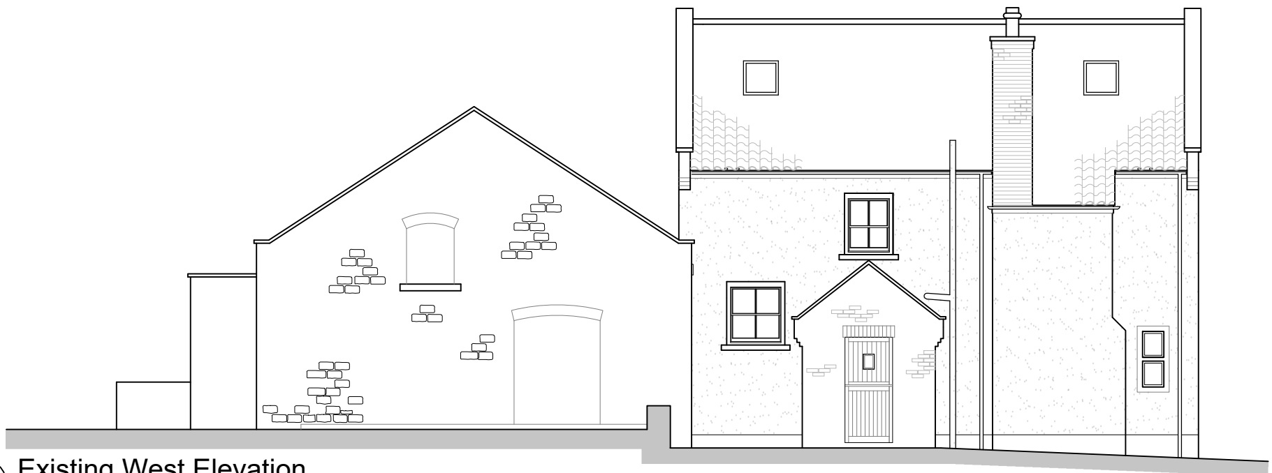
2 Existing West Elevation Scale: 1:100