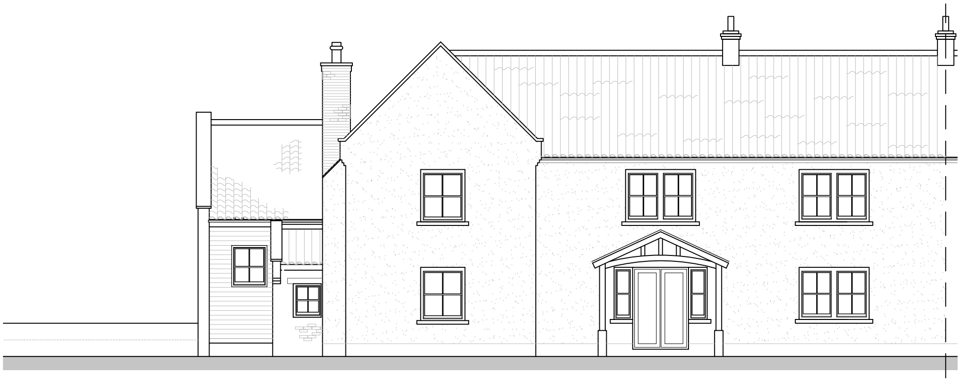
3 Existing South Elevation Scale: 1:100