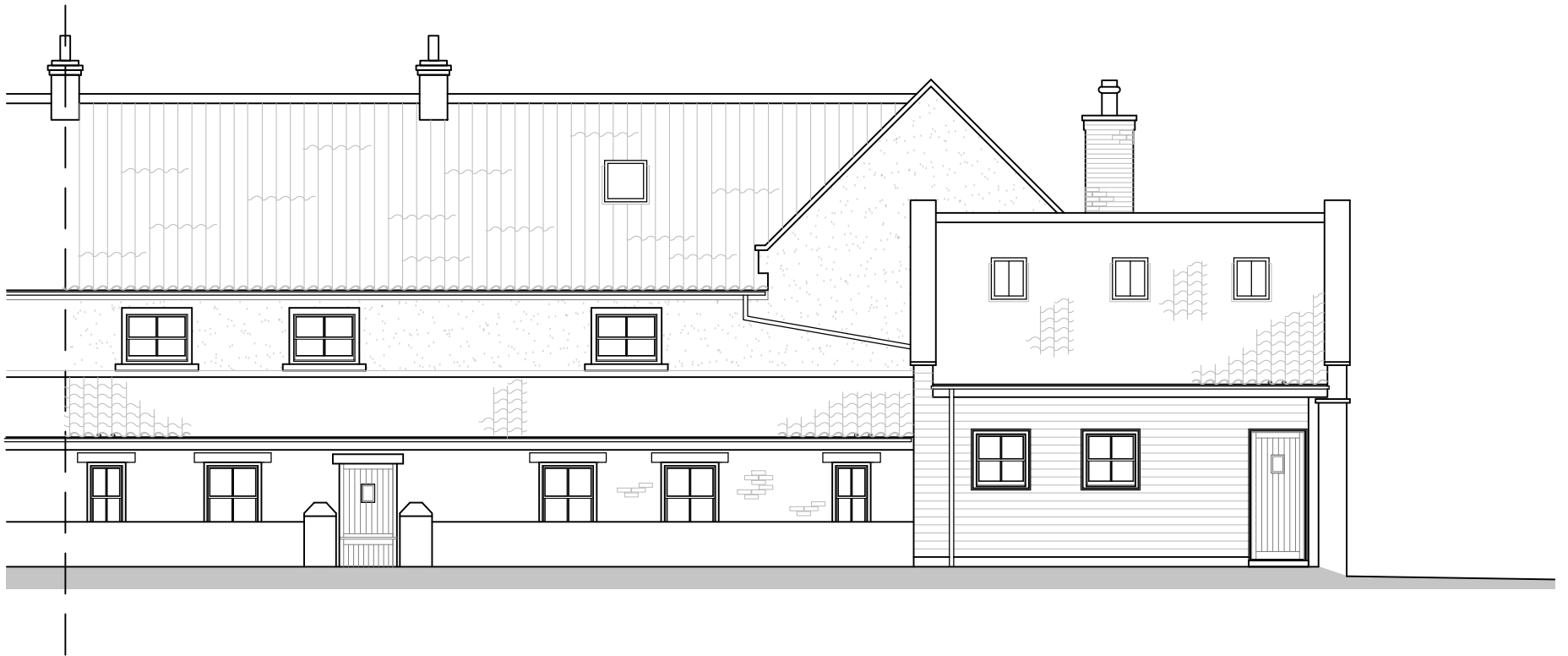
3 Existing North Elevation Scale: 1:100