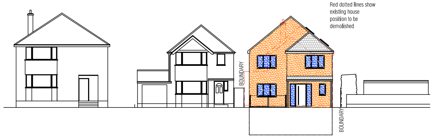
PROPOSED FRONT STREET VIEW, 1:200

Studio Charrette will not be responsible for any principal designer duties under CDM 2015. No site work is to be carried out until permissions are in place. Site searches to be carried out before any works to site. All structural elemental/associated calculations to be confirmed and provided by structural engineer.