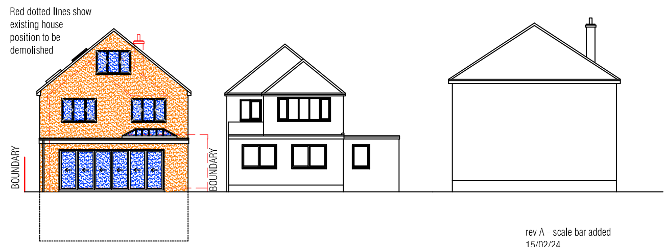
PROPOSED REAR STREET VIEW, 1:200