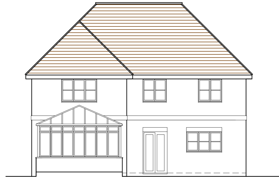
REAR ELEVATION SHOWING CONSERVATORY