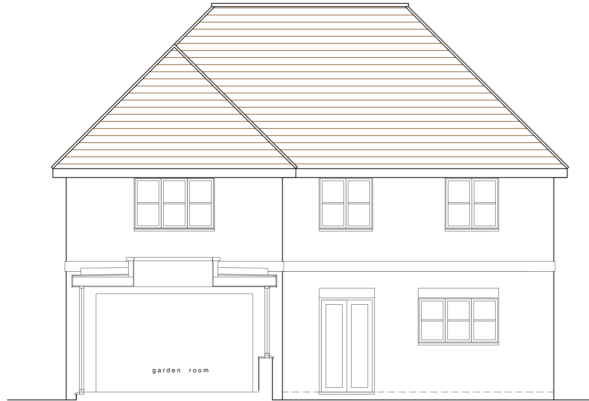
REAR ELEVATION / SECTION THRU' GARDEN ROOM

All dimensions and levels to be checked on site and any discrepancies to be reported to the architect before construction. Written dimensions to be taken in preference to scaled dimensions.