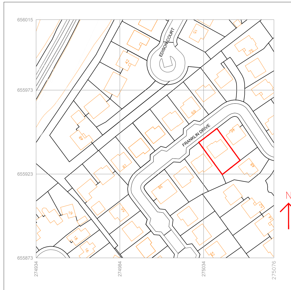
Location plan scale 1:1250 @ A3