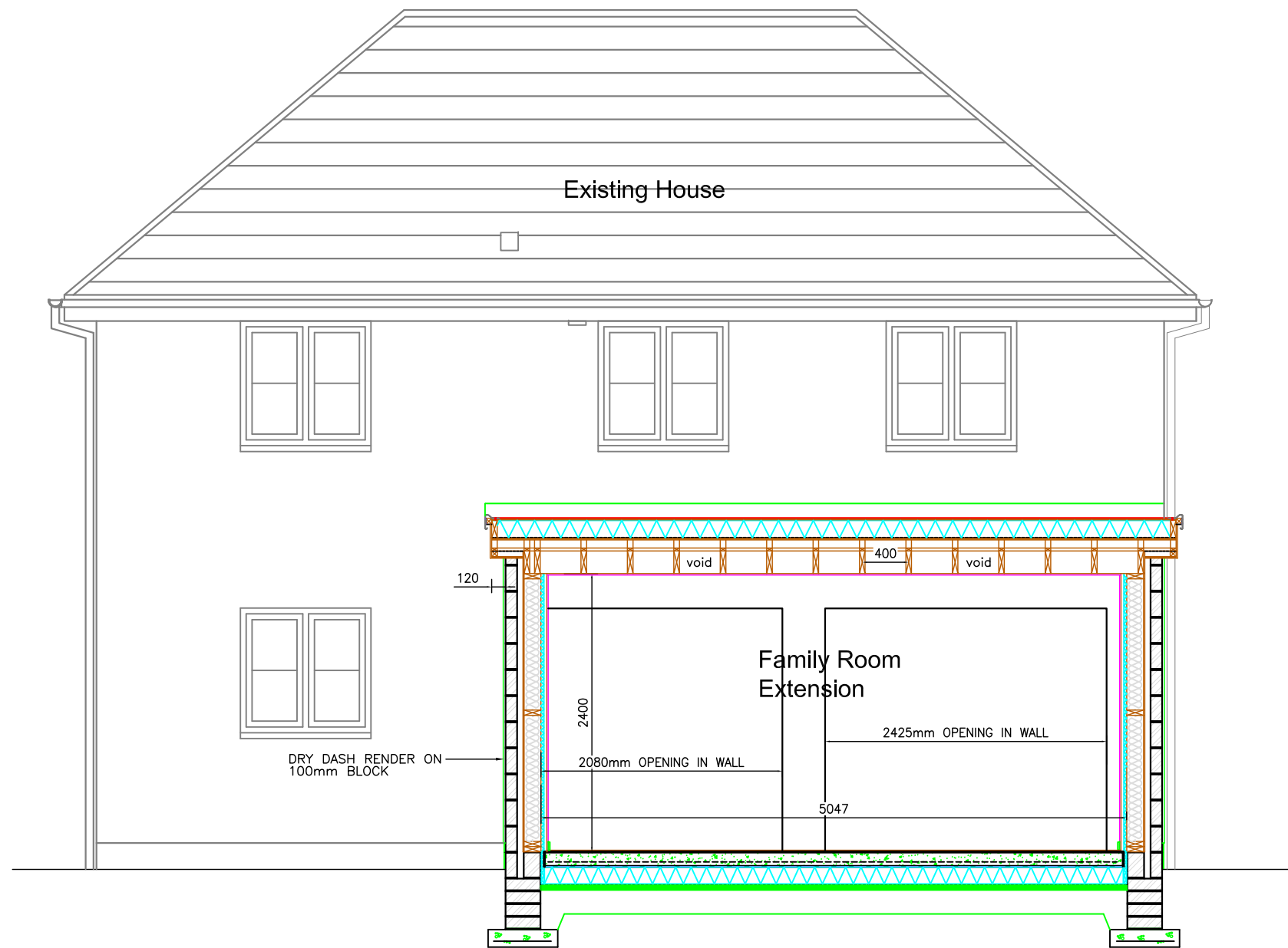
Proposed Section A-A 1:50