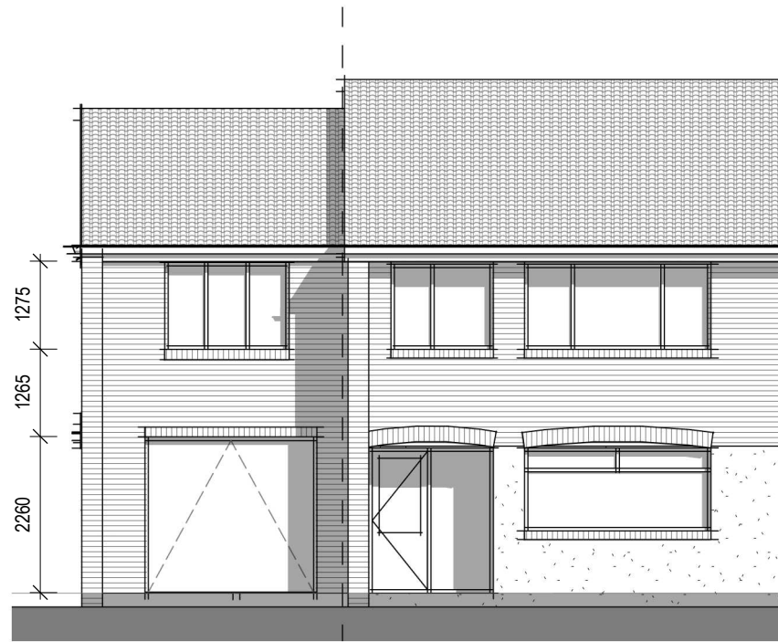
Front Elevation 1 : 100