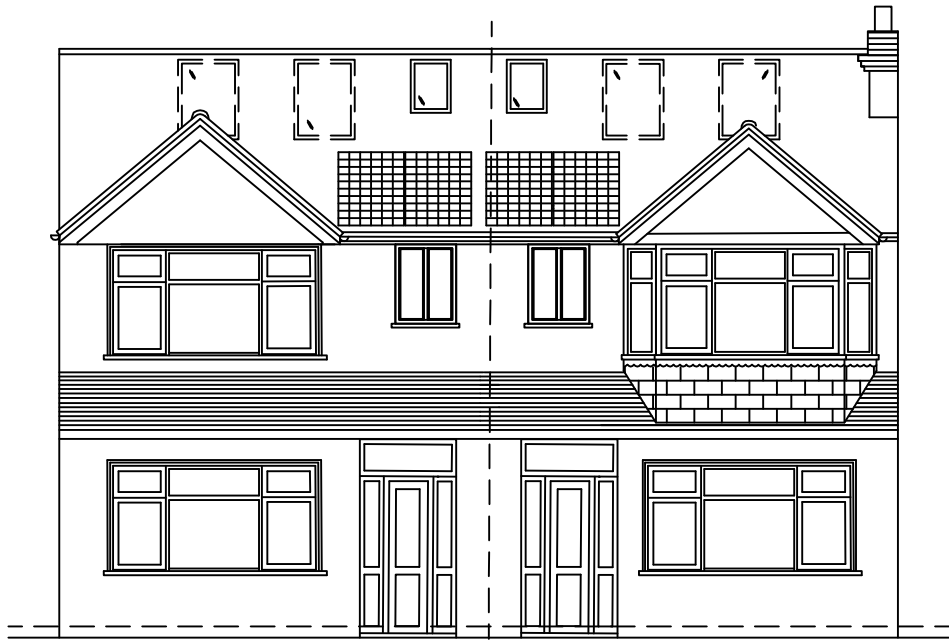
FRONT ELEVATION (PROPOSED)