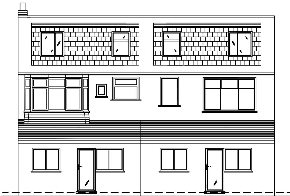
REAR ELEVATION (PROPOSED)