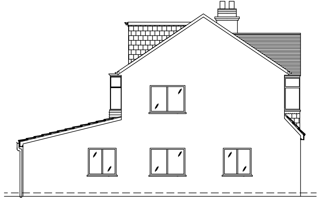
SIDE ELEVATION (PROPOSED)