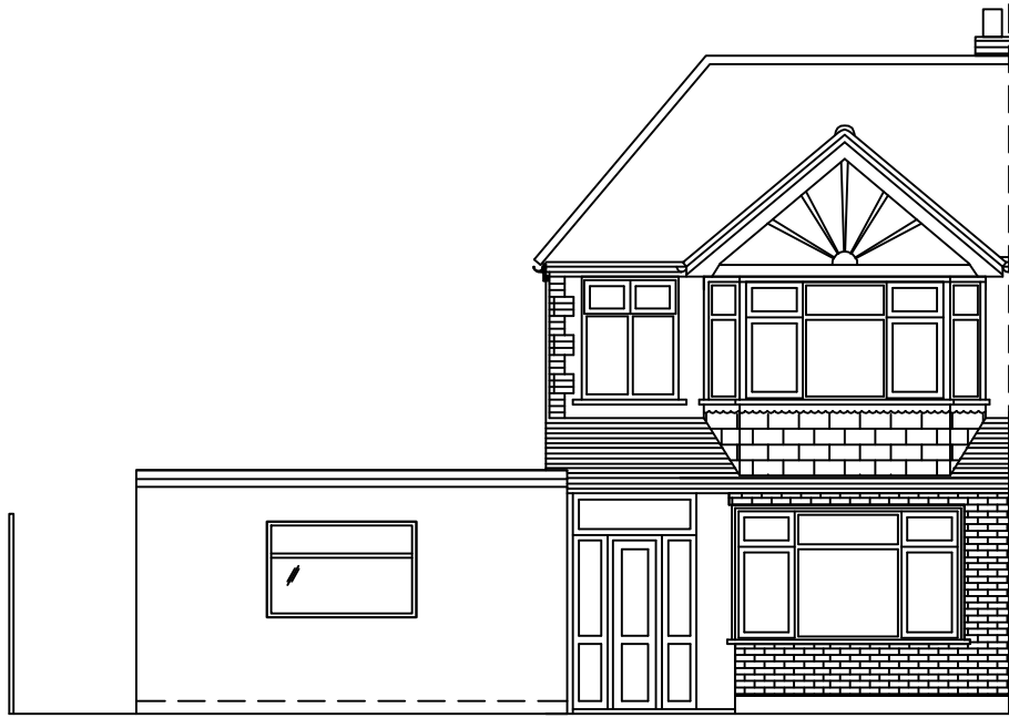
FRONT ELEVATION (PRE-EXISTING)