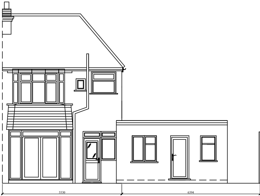
REAR ELEVATION (PRE-EXISTING)