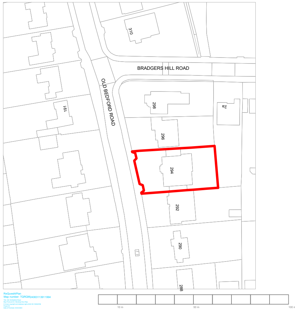
Location Plan @ 1:1250