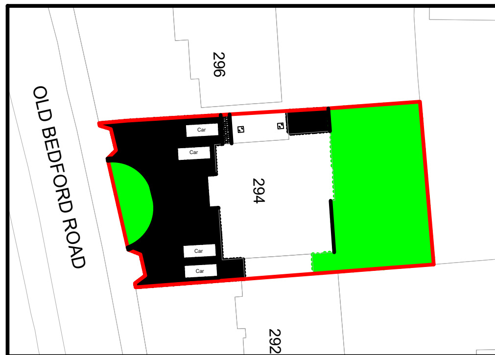
Existing Block Plan @ 1:500