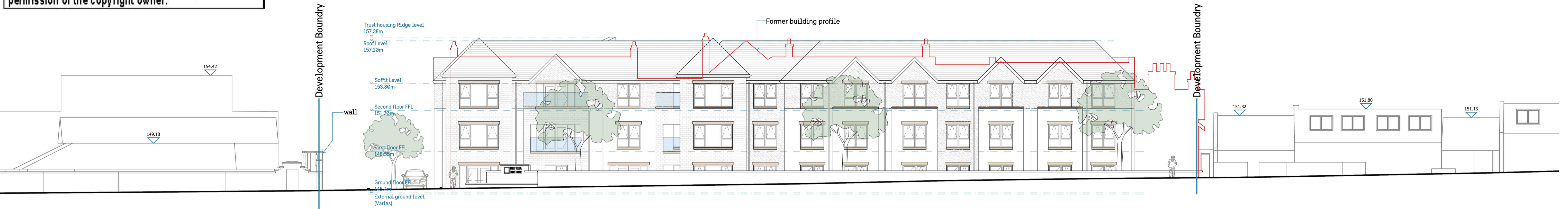
CONTEXTUAL STREET ELEVATION 01: South-West Elevation to Hawthorn Gardens Scale- 1:150

This copy has been made by or with the authority of Midlothian Council pursuant to Section 47 of the Designs and Patents Act 1988. Unless that Act provides a relevant exception to copyright, the copy must not be copied without the prior permission of the copyright owner.