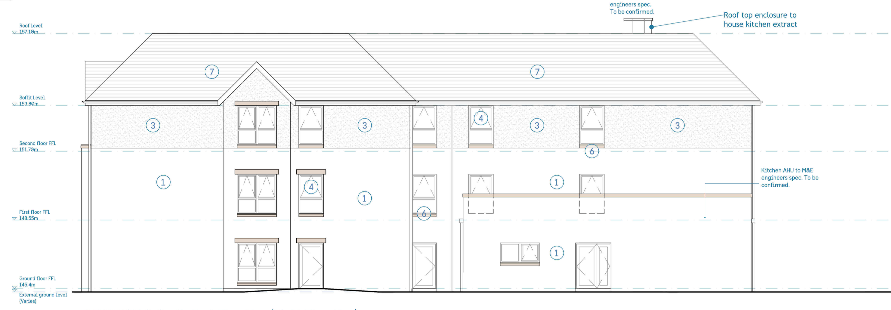
ELEVATION C: South-East Elevation (Right Elevation) Scale- 1:100