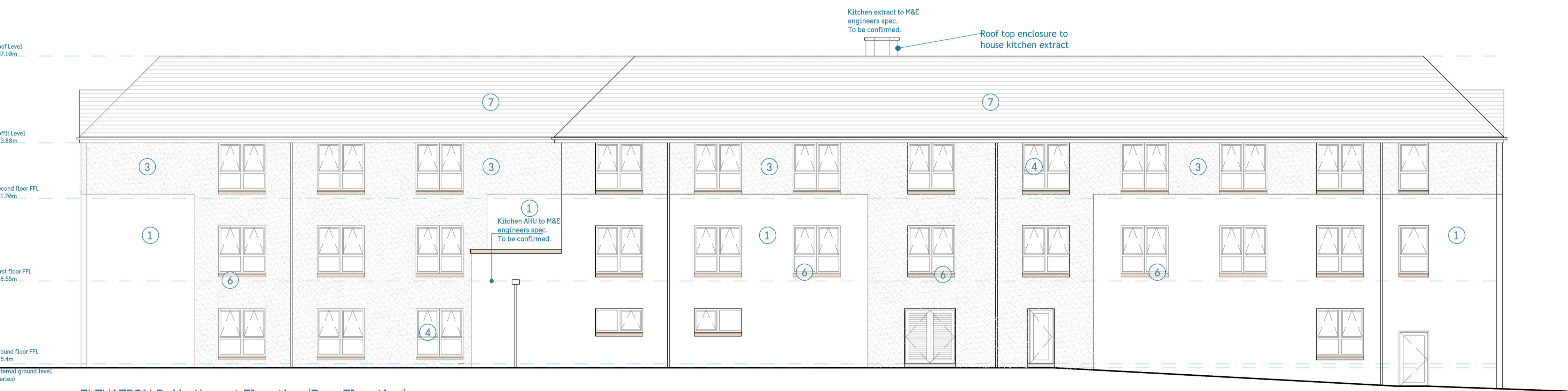
ELEVATION D: North-east Elevation (Rear Elevation) Scale- 1:100