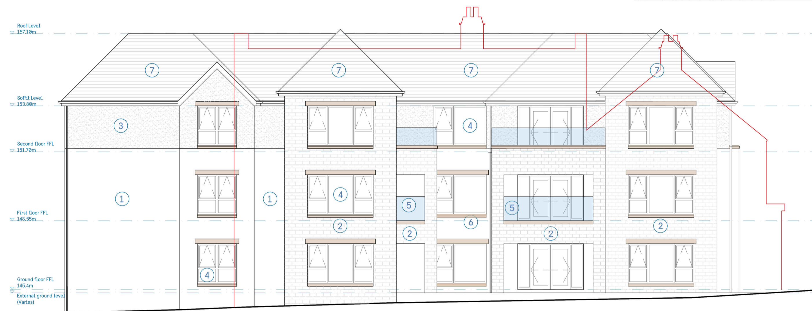
ELEVATION B: North-West Elevation (Left Elevation) Scale- 1:100

This copy has been made by or with the authority of Midlothian Council pursuant to Section 47 of the Designs and Patents Act 1988. Unless that Act provides a relevant exception to copyright, the copy must not be copied without the prior permission of the copyright owner.