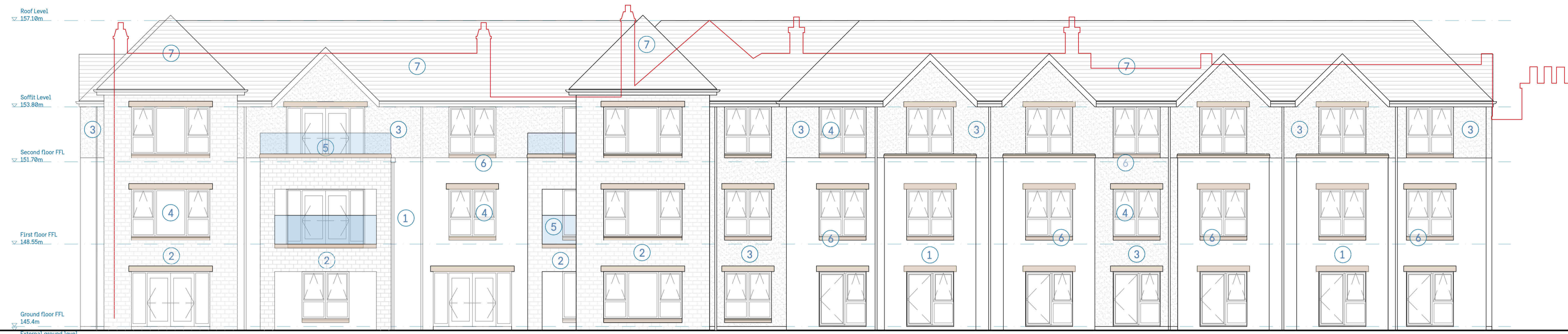
ELEVATION A: South-West Elevation to Hawthorn Gardens (Front Elevation) Scale- 1:100

This copy has been made by or with the authority of Midlothian Council pursuant to Section 47 of the Designs and Patents Act 1988. Unless that Act provides a relevant exception to copyright, the copy must not be copied without the prior permission of the copyright owner.