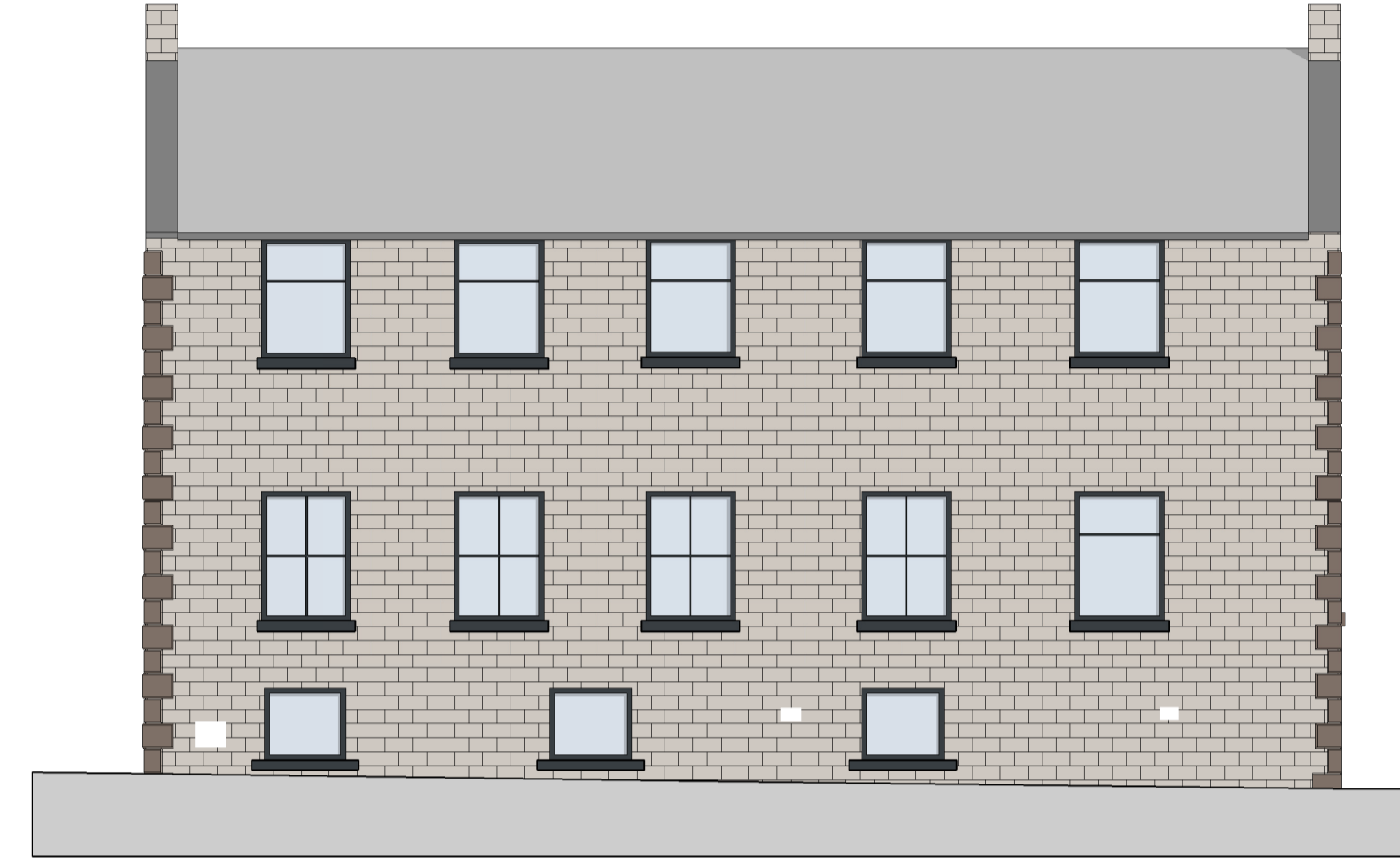
2 Elevation B - as Existing 1 : 100