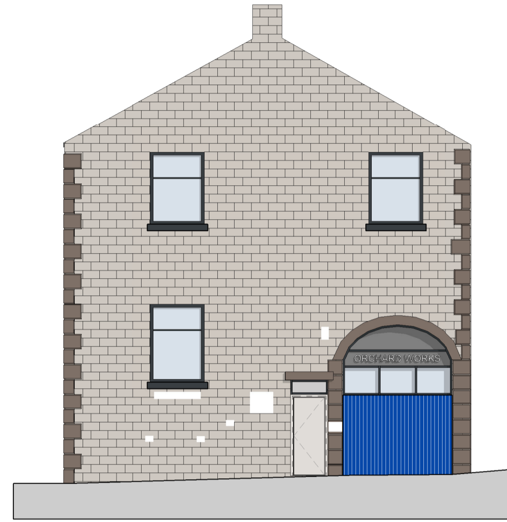
1 Elevation A - as Existing 1 : 100

Drawing Status PLANNING This drawing is © C4 Projects and is not to be copied, reproduced or re-distributed either in whole or in part without the prior written permission of the originator. The originator shall have no responsibility for any liability, loss, cost, damage or expense arising from or relating to any use of this document other than for its intended purpose on this project. This drawing shall be read in conjunction with all other relevant drawings, specifications and associated documentation. Any discrepancies, errors or omissions are to be reported to the originator before proceeding with work. All dimensions are to be checked on site by the contractor prior to proceeding with any work. This drawing shall not be scaled to ascertain any dimensions, work to figured dimensions only. DISCLAIMER When this drawing is issued in CAD, it is an uncontrolled version issued for information only, to enable the recipient to prepare their own documents/ drawings for which they are solely responsible. SOFTWARE INTEROPERABILITY C4 Projects prepared this drawing using Autodesk REVIT Architecture. C4 Projects does not accept liability for any loss or degradation of any information held in the drawing resulting from the translation from the original file format to any other file format or from the recipient's reading of it in any other programme.