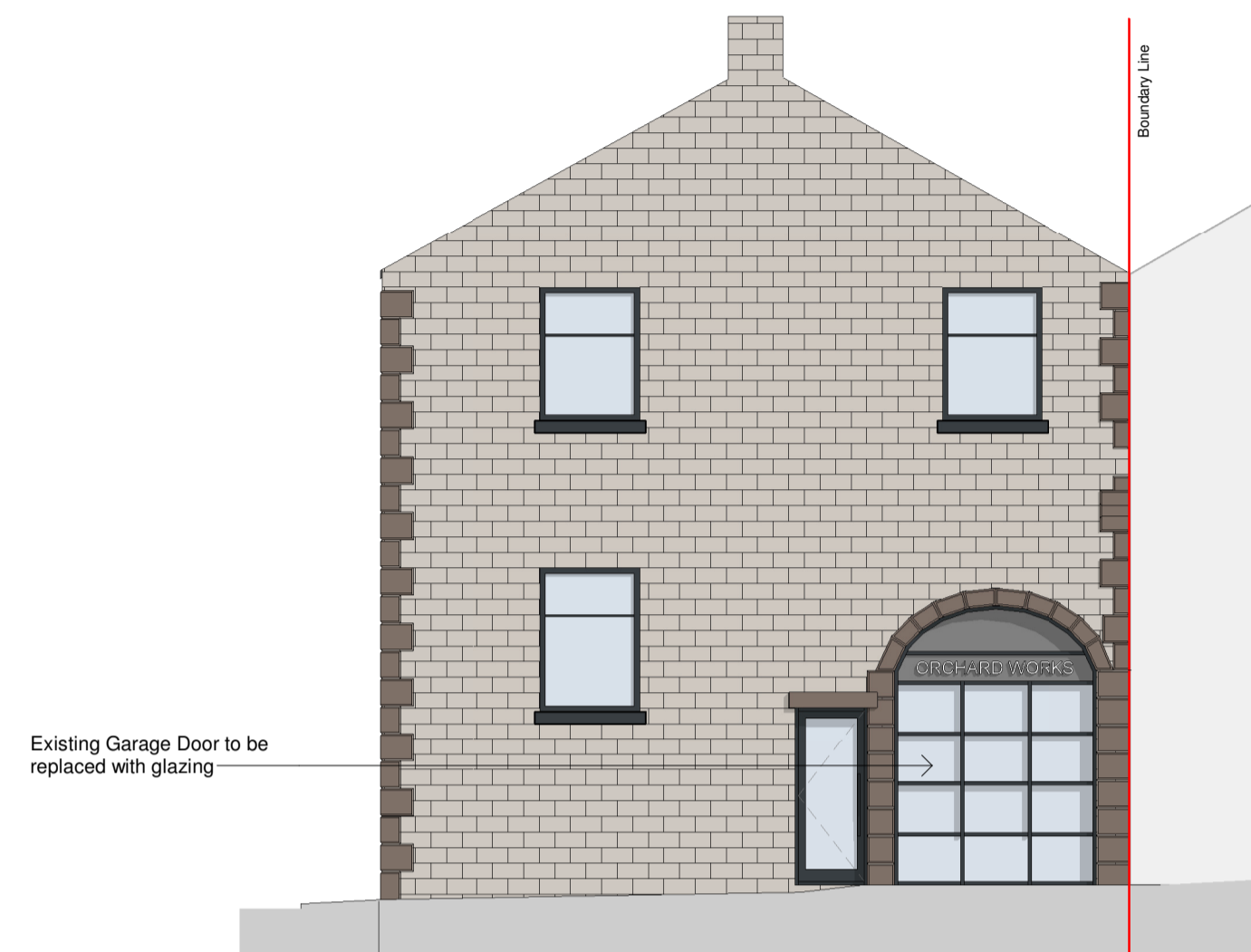
1 Elevation A 1 : 100

SOFTWARE INTEROPERABILITY C4 Projects prepared this drawing using Autodesk REVIT Architecture. C4 Projects does not accept liability for any loss or degradation of any information held in the drawing resulting from the translation from the original file format to any other file format or from the recipient's reading of it in any other programme.