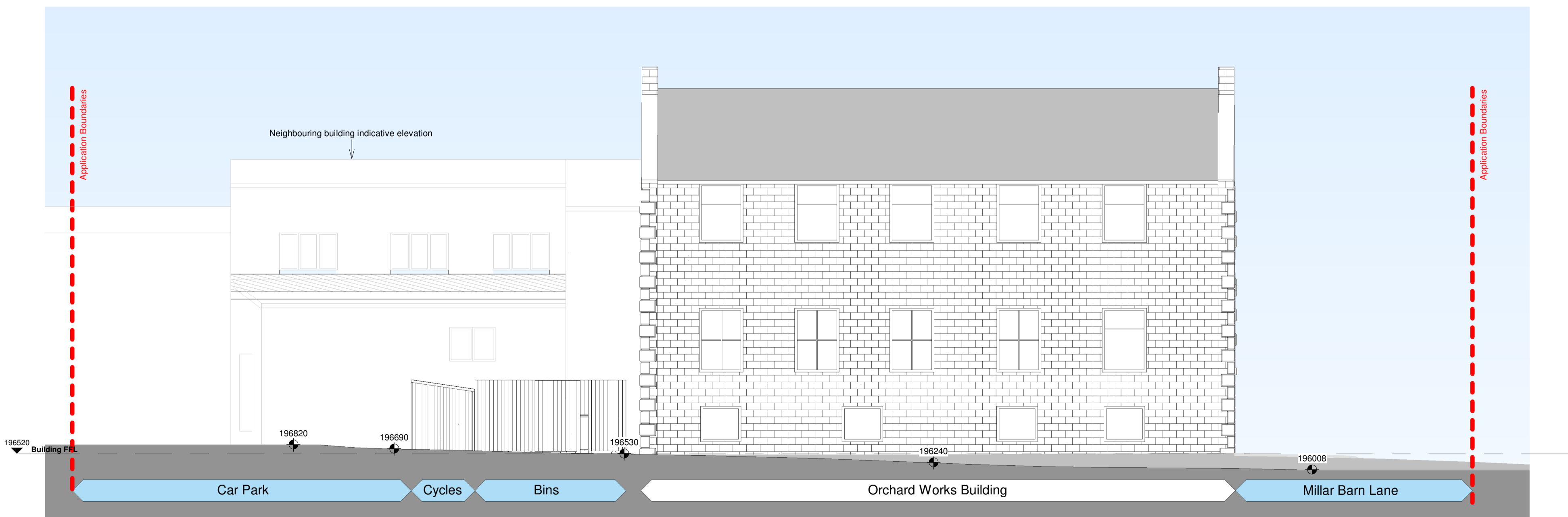
2 Indicative Site Section - Section 02 1 : 100

NOTE: Sections shown indicatively. All site levels to be confirmed on site.