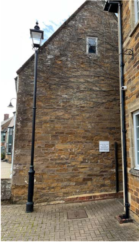
Photo 15 - Part 4 of the Work showing the position of the gable and the window.