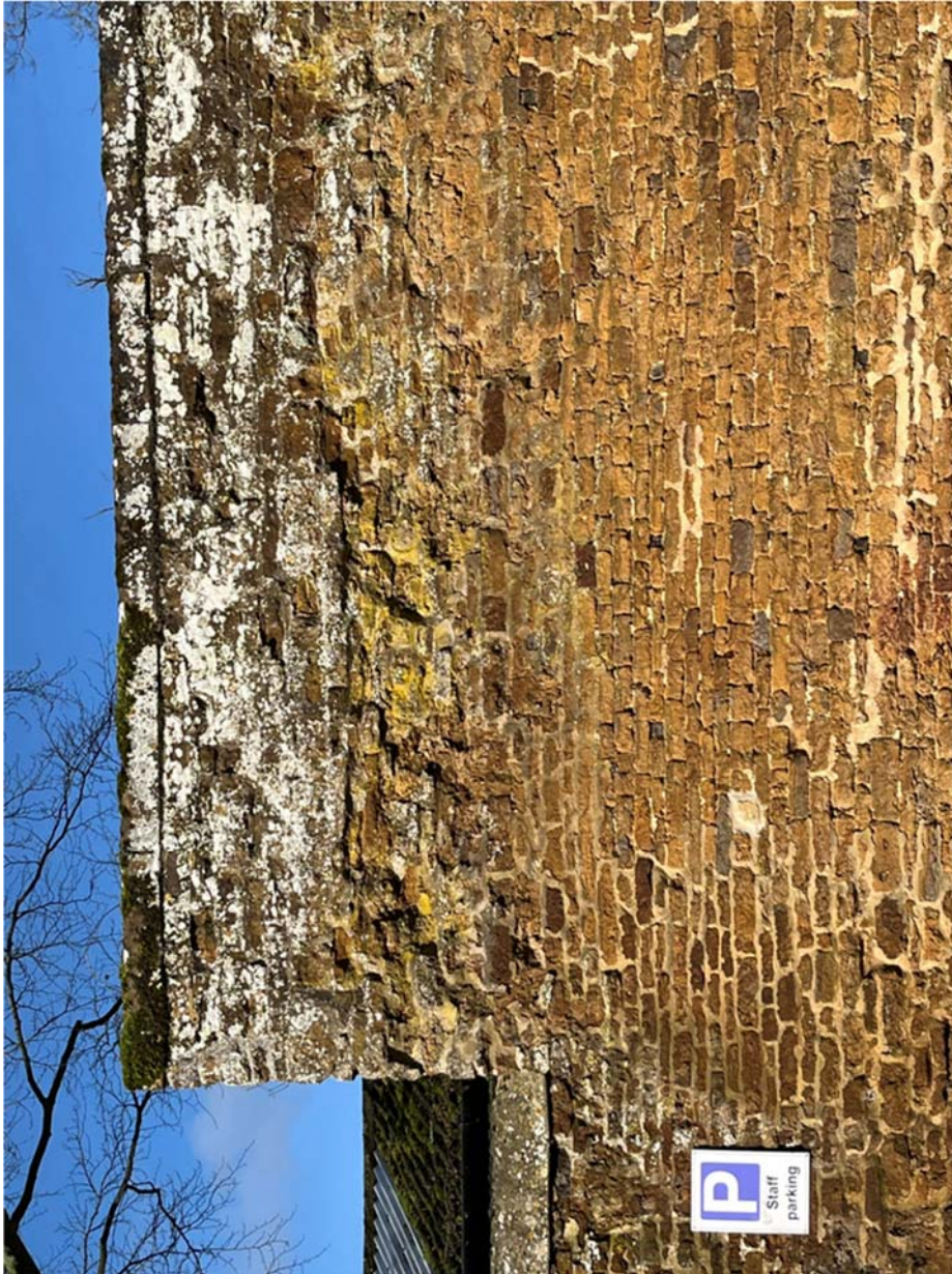
Photo 8 – Part 2 of Work – View of part of Wall from distance from Uppingham Town Council Car Park