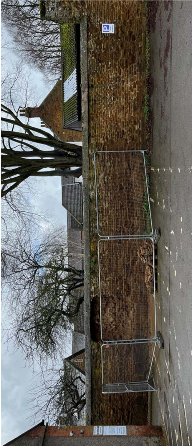
Photo 1 – Part 1 of Work – View of part of Wall from distance from Uppingham Town Council Car Park. It shows that a portion of the wall has collapsed.