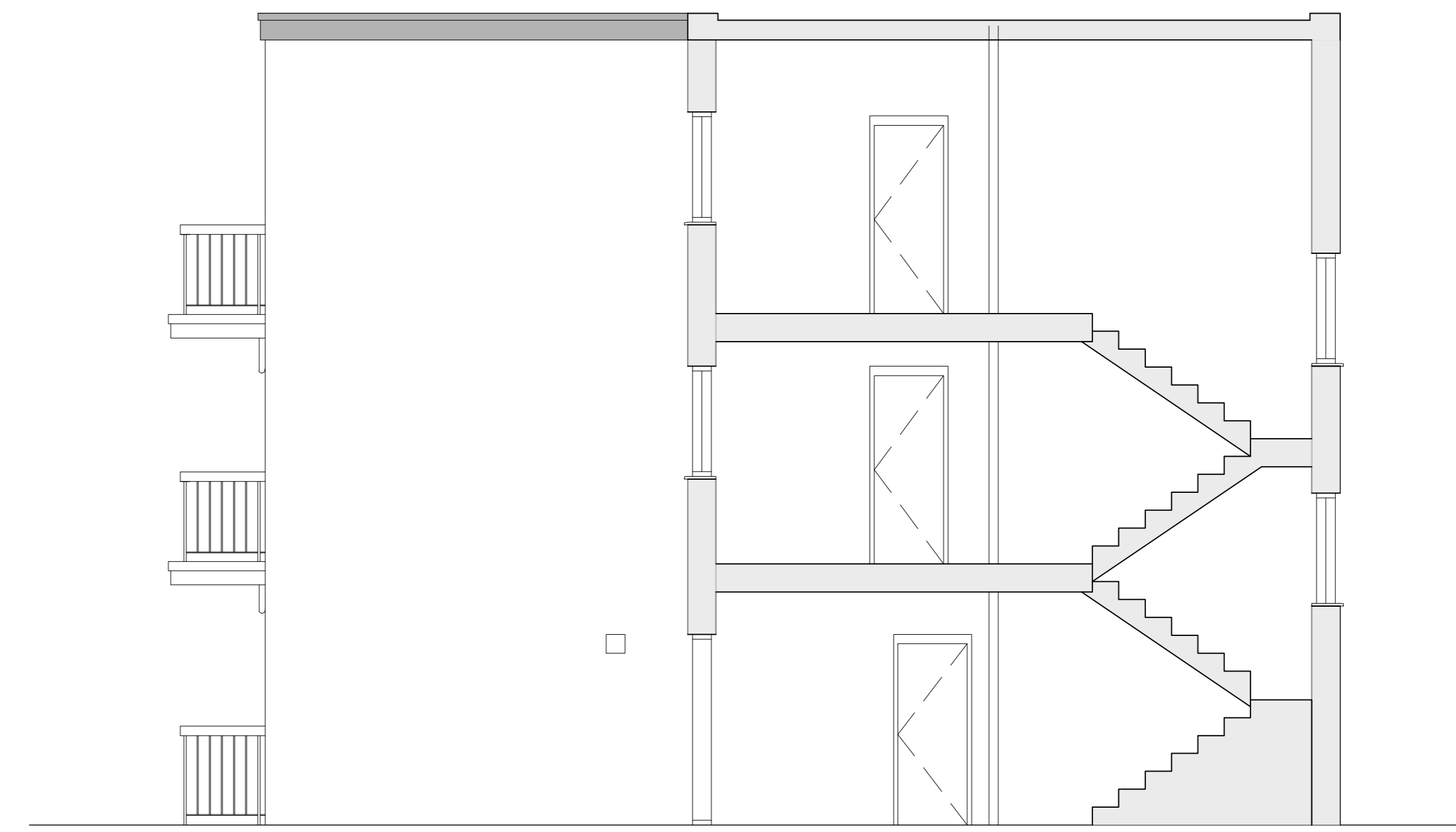
Existing Section A-A