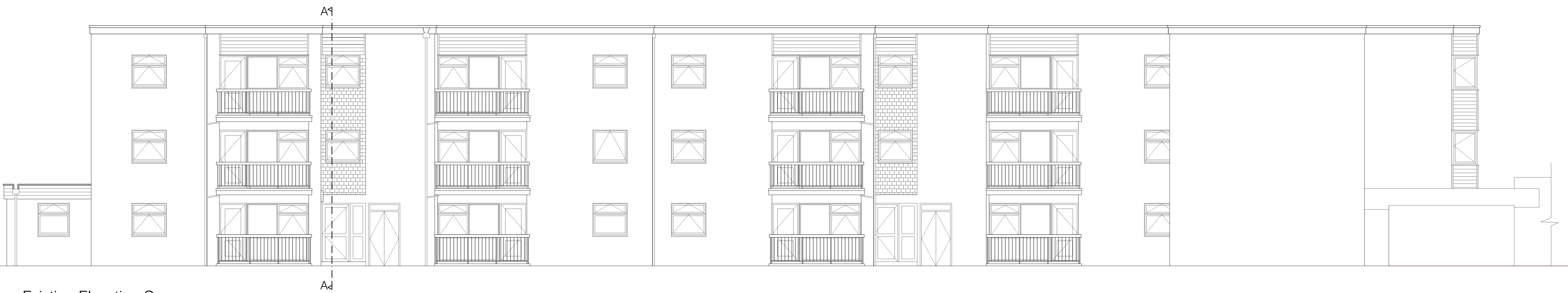
Existing Elevation C