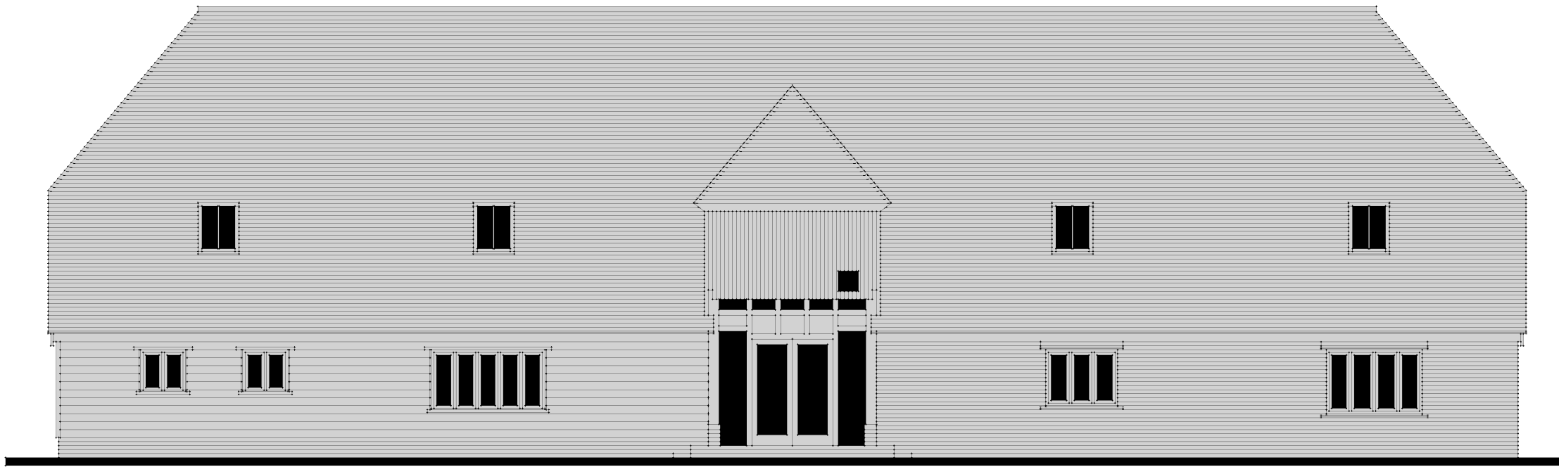
Proposed South West Elevation

Drawing: TOKB – 41 rev 00 Title: New Window – Elevation & Plan as Proposed Scale: 1:100 @A3 Date: 2024. February. 25 Status: Listed Building Consent