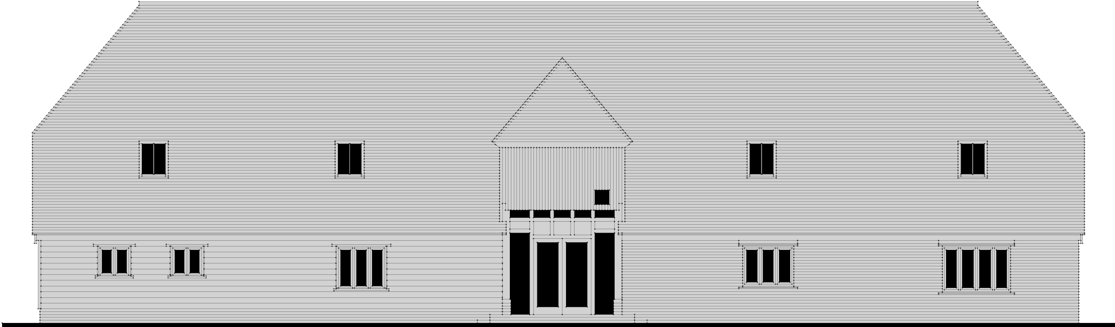
Existing South West Elevation

Drawing: TOKB – 40 rev 00 Title: New Window – Elevation & Plan as Existing Scale: 1:100 @A3 Date: 2024. February. 25 Status: Listed Building Consent