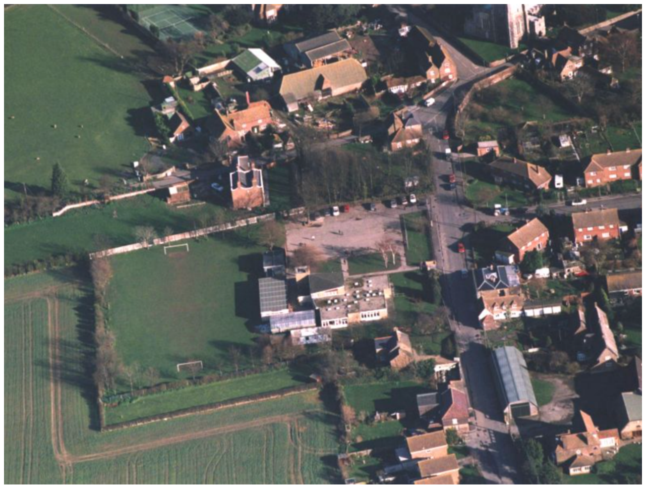
Aerial views looking north towards the original barn prior to its conversion in 2001

4.1 The agricultural barn prior to conversion to a dwelling