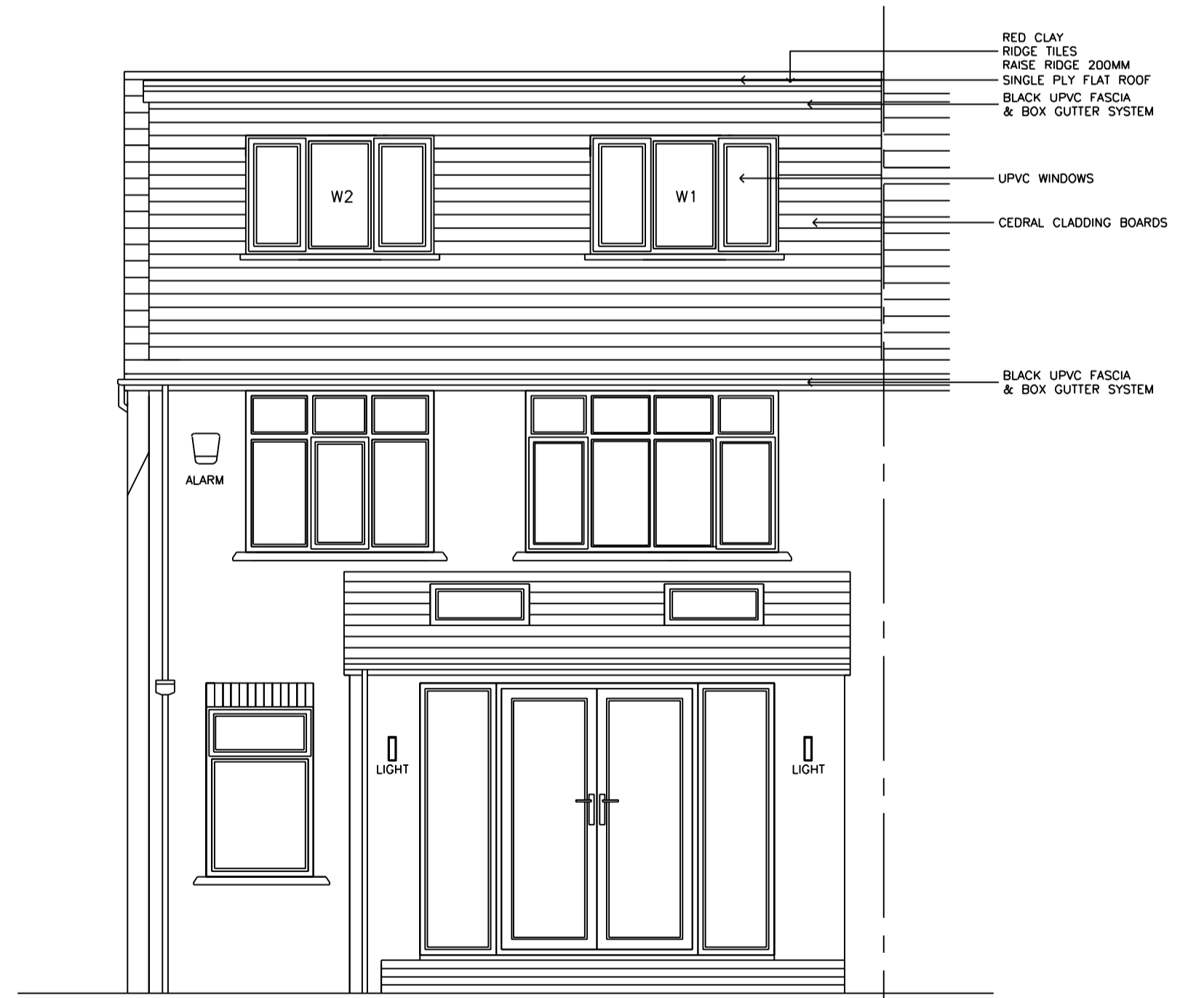
PROPOSED REAR FACING ELEVATION (SCALE 1:50)