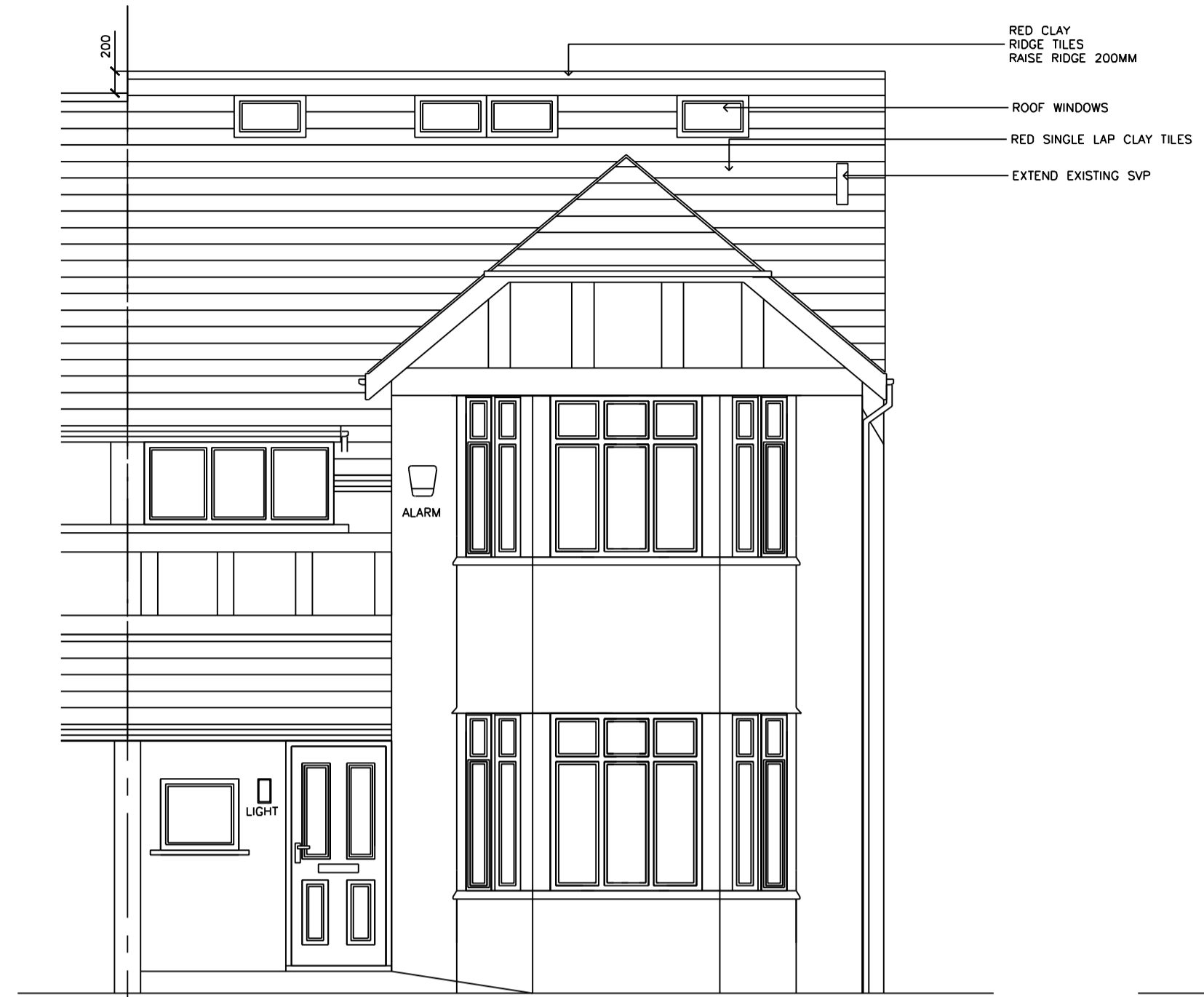
PROPOSED FRONT FACING ELEVATION (SCALE 1:50)