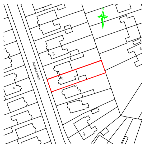
LOCATION PLAN (SCALE 1:1250)