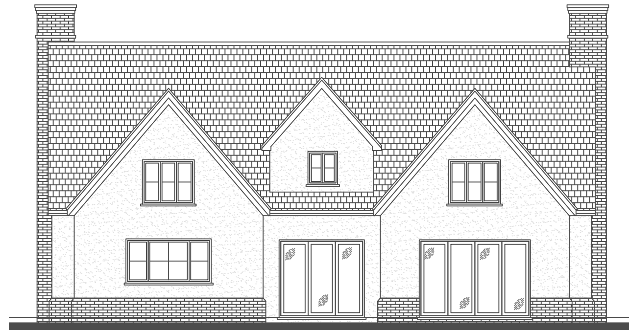
Existing Rear Elevation Scale 1:100