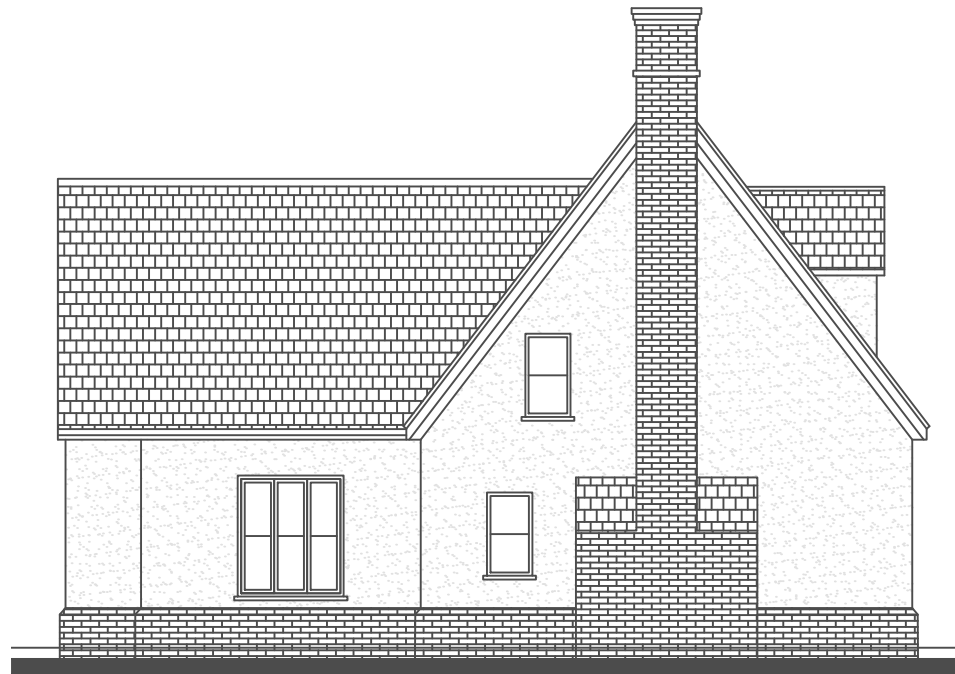
Existing Side Elevation Scale 1:100