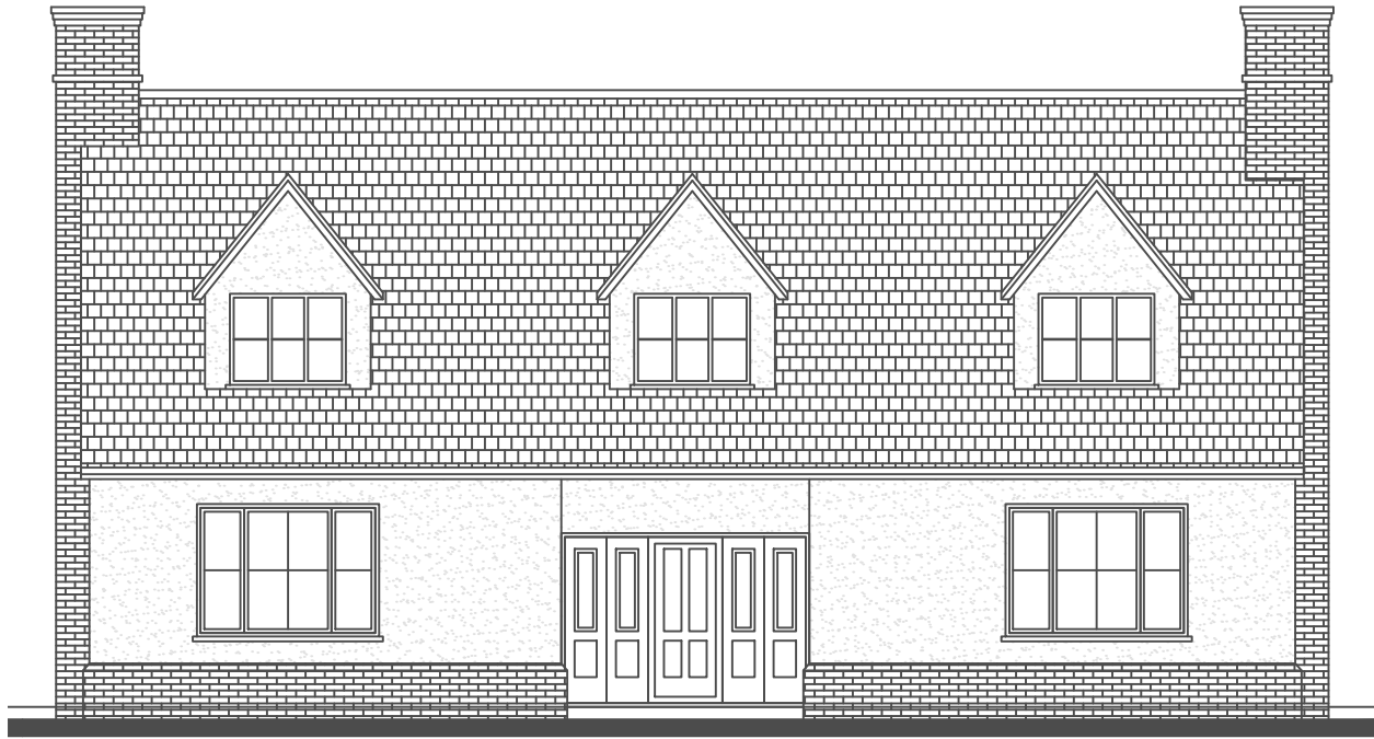
Existing Front Elevation Scale 1:100