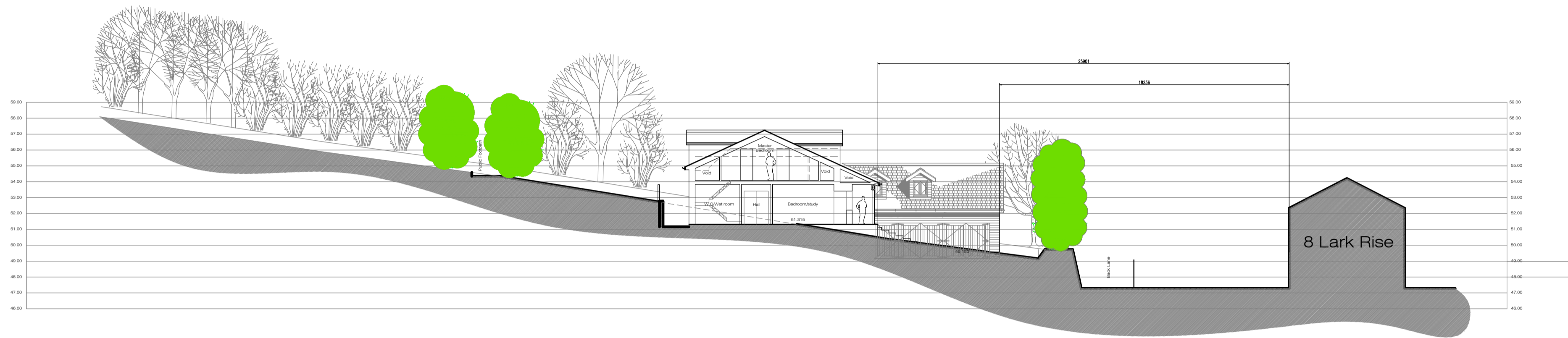
PROPOSED SITE SECTION AA 1:200