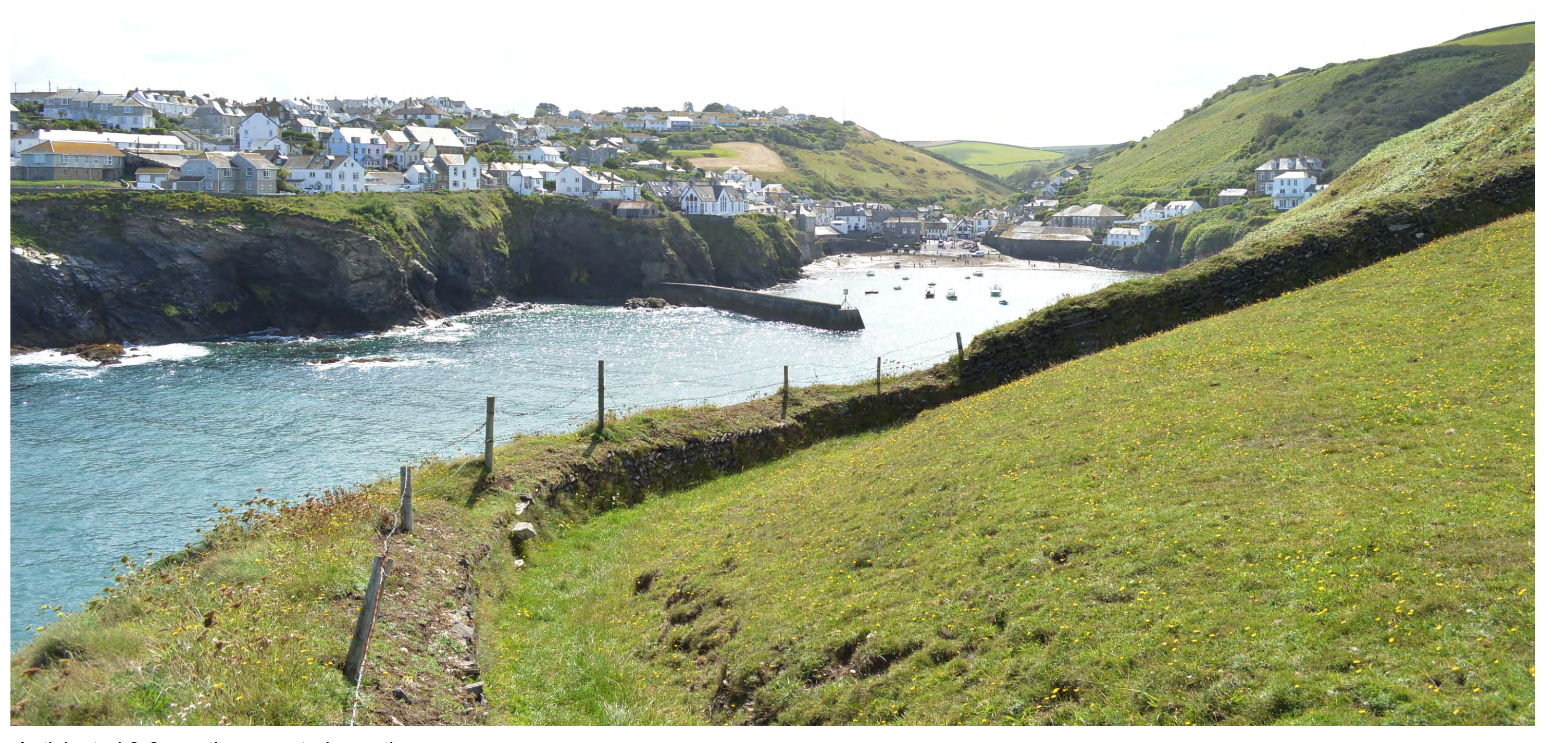
Anticipated 3-6 months expected growth

THIS DRAWING IS COPYRIGHT Contractors and Consultants must check all dimensions on site. Any discrepancies to be reported to Laurence Associates before work profits in the property of the purpose intended. PLEASE D