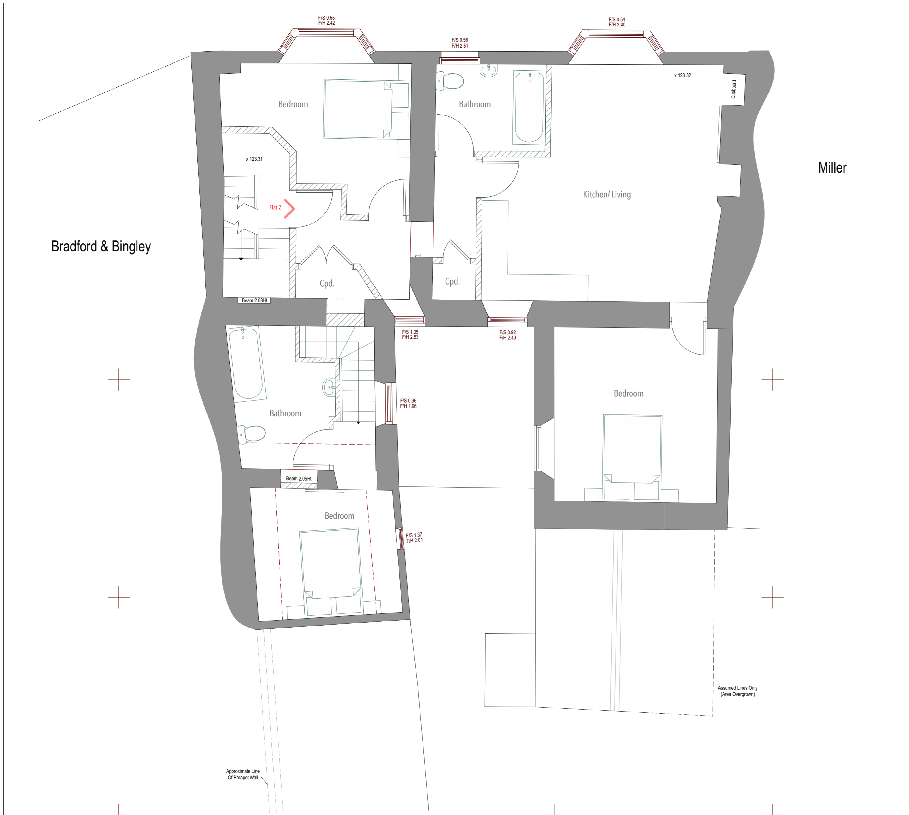
Proposed First Floor Plan 1:50