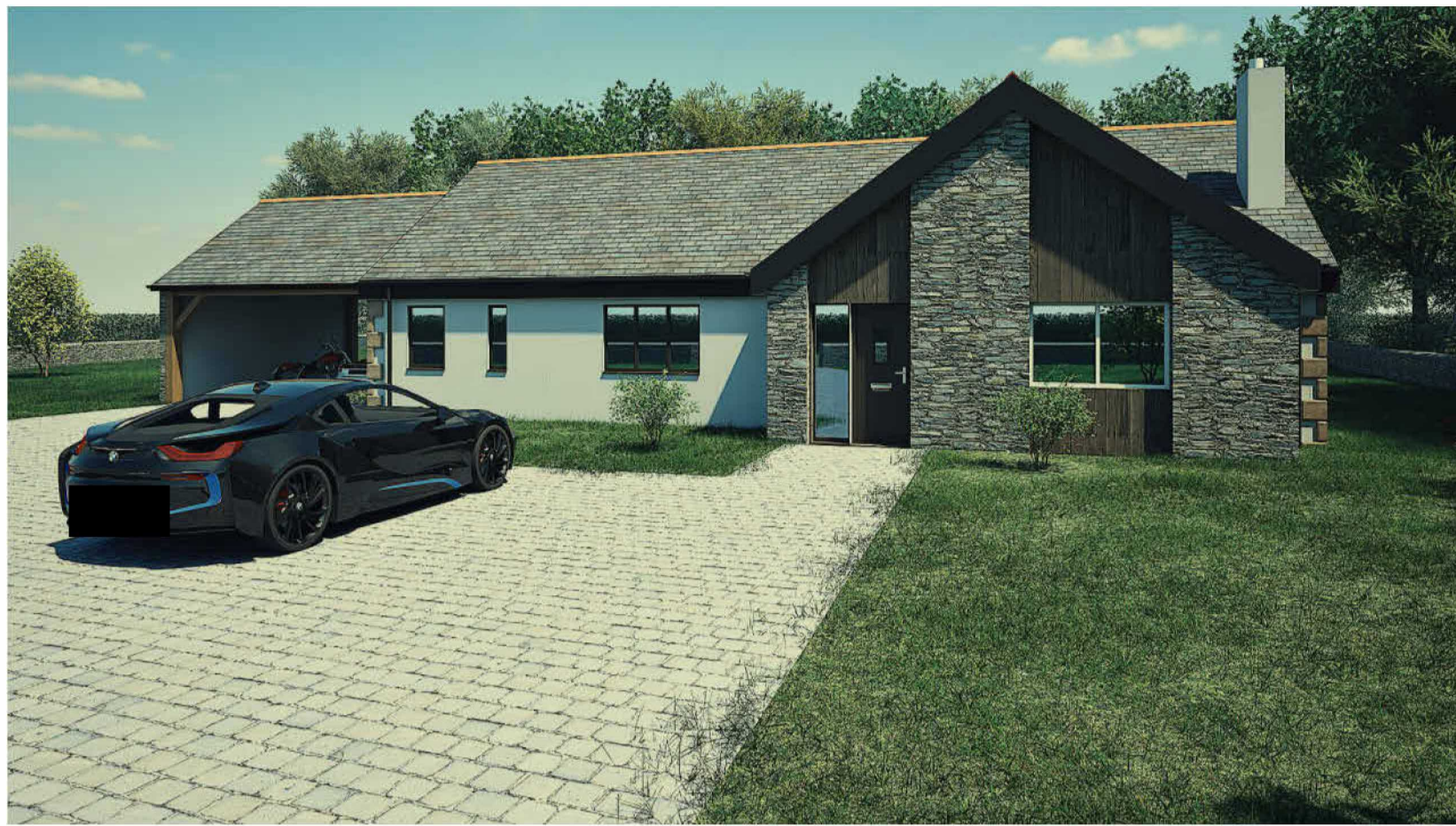
1. North East View