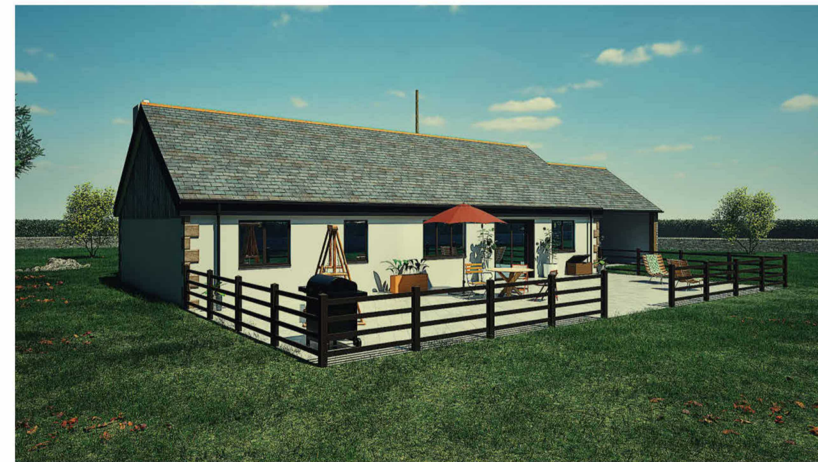
6. West View