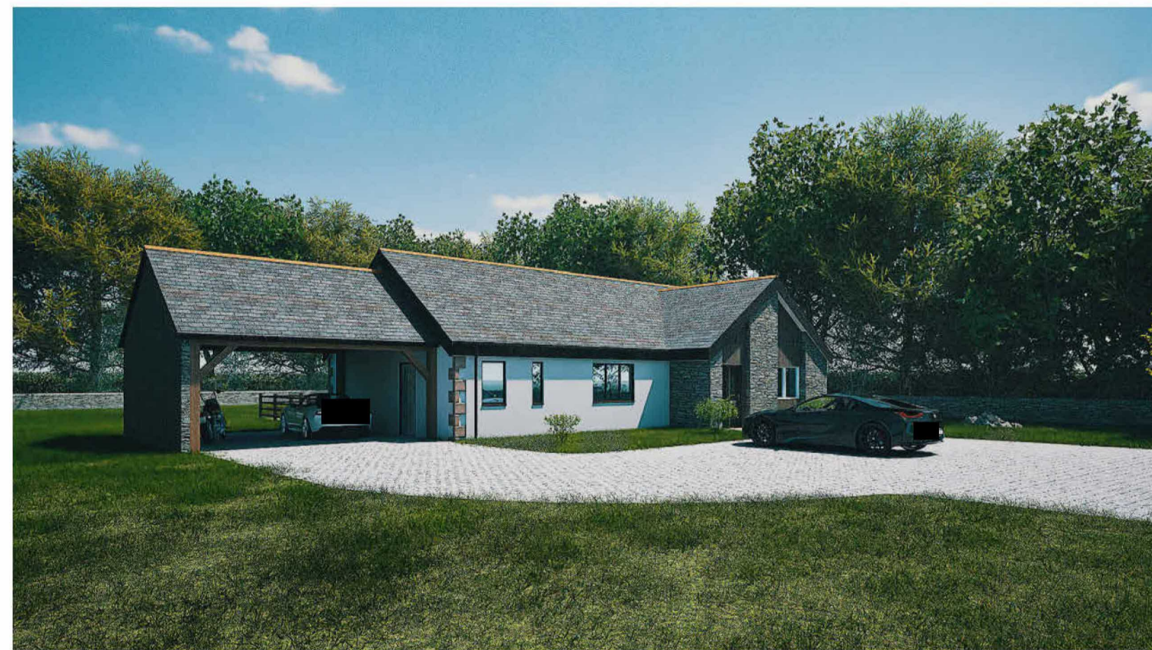
5. East View