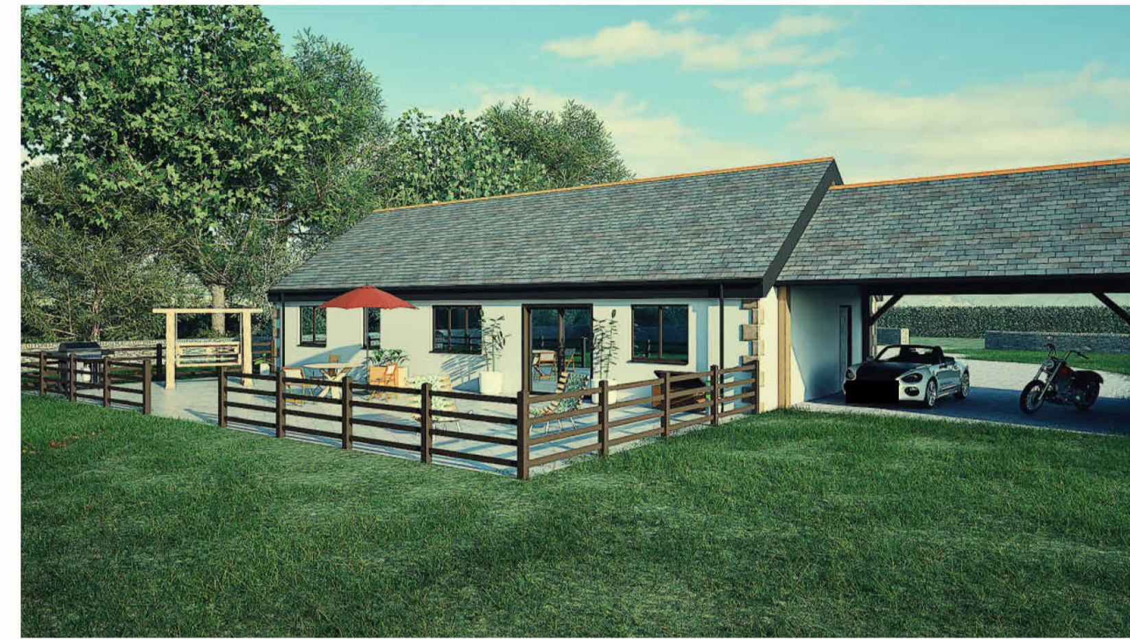
3. South West View