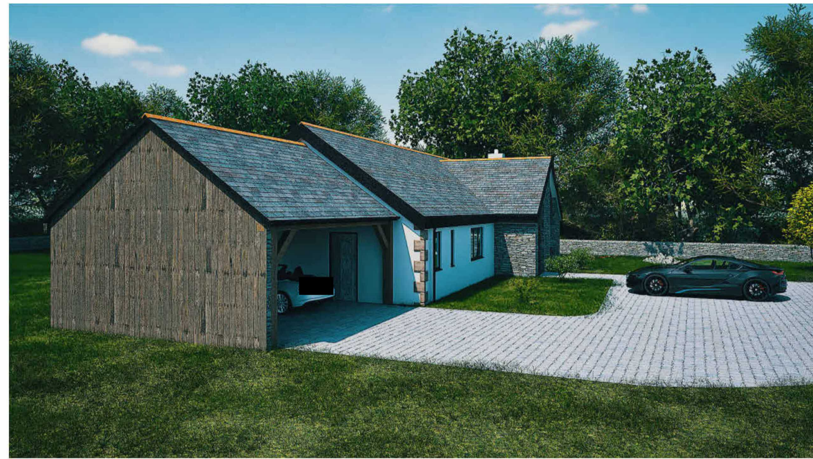
2. South East View