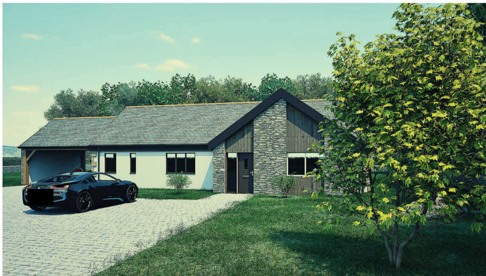
4. North East View 2