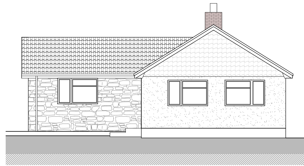
EAST ELEVATION [SCALE 1:100]