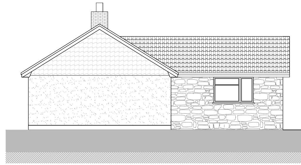
WEST ELEVATION [SCALE 1:100]