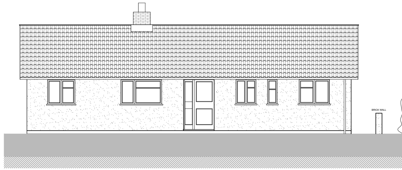
NORTH ELEVATION [SCALE 1:100]

2. All dimensions to be checked on site and any discrepancy immediately reported to the architect.