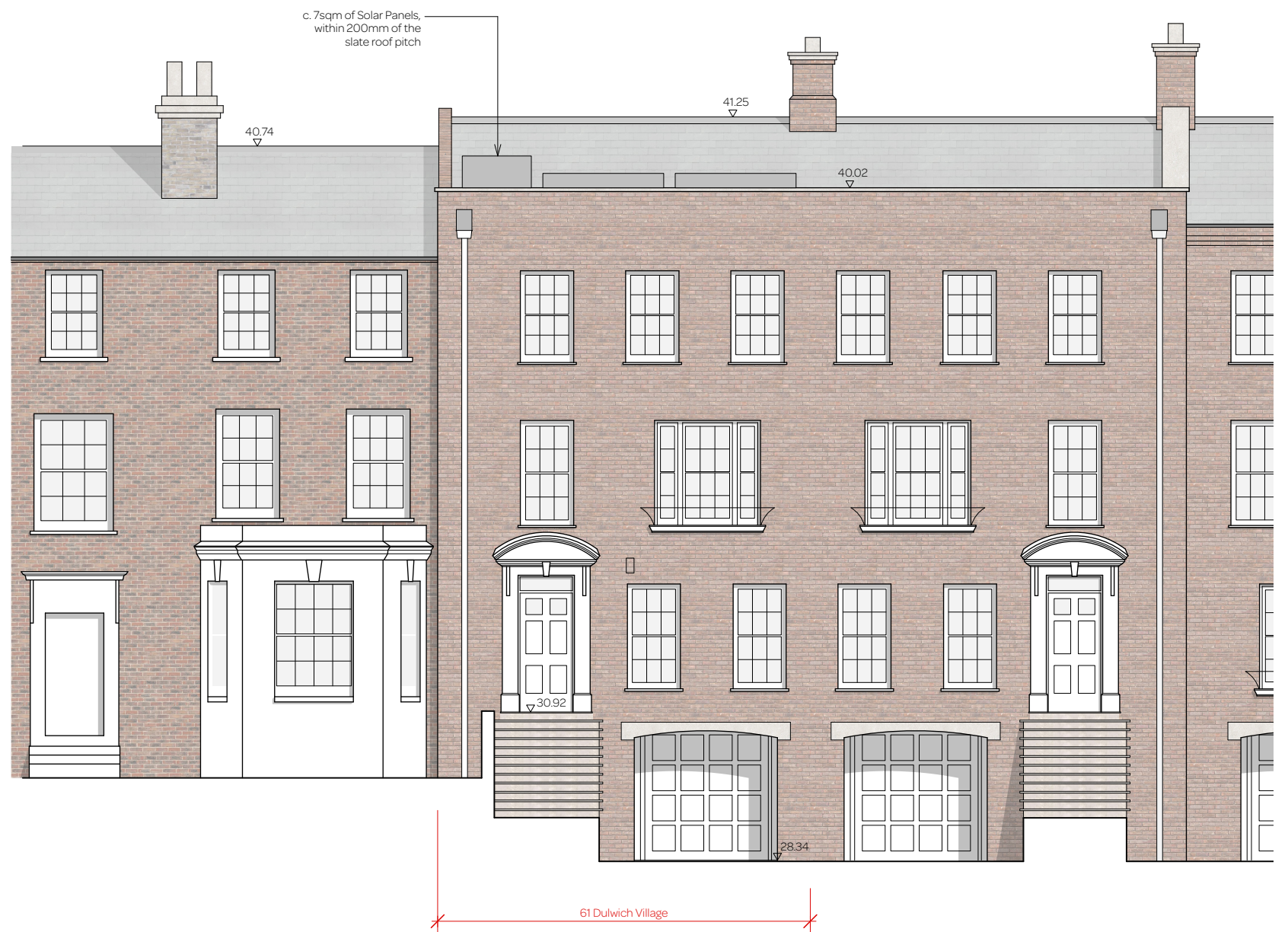
2 Proposed Street Elevation

Do not scale off this drawing. All trade contractors to be responsible for taking and checking their own site dimensions. Any errors or omissions to be reported to Stephen Kavanagh Architects immediately, prior to work being carried out. All site dimensions shown are based upon the measured survey of the property, carried out by independent surveyors. The accuracy of this information is not the responsibility of Stephen Kavanagh Architects. Stephen Kavanagh Architects also accept no responsibility for the accuracy of any structural and servicing information shown on this drawing. This information is shown for guidance purposes only, and where applicable is based on information provided by the consulting structural engineers, consulting M&E engineers, client representatives, and/or specialist subcontractors respectively. Reference should always be made to engineers and subcontractors current drawings and specifications. This drawing and design is the copyright of Stephen Kavanagh Architects and is not to be used for any purpose without their consent.