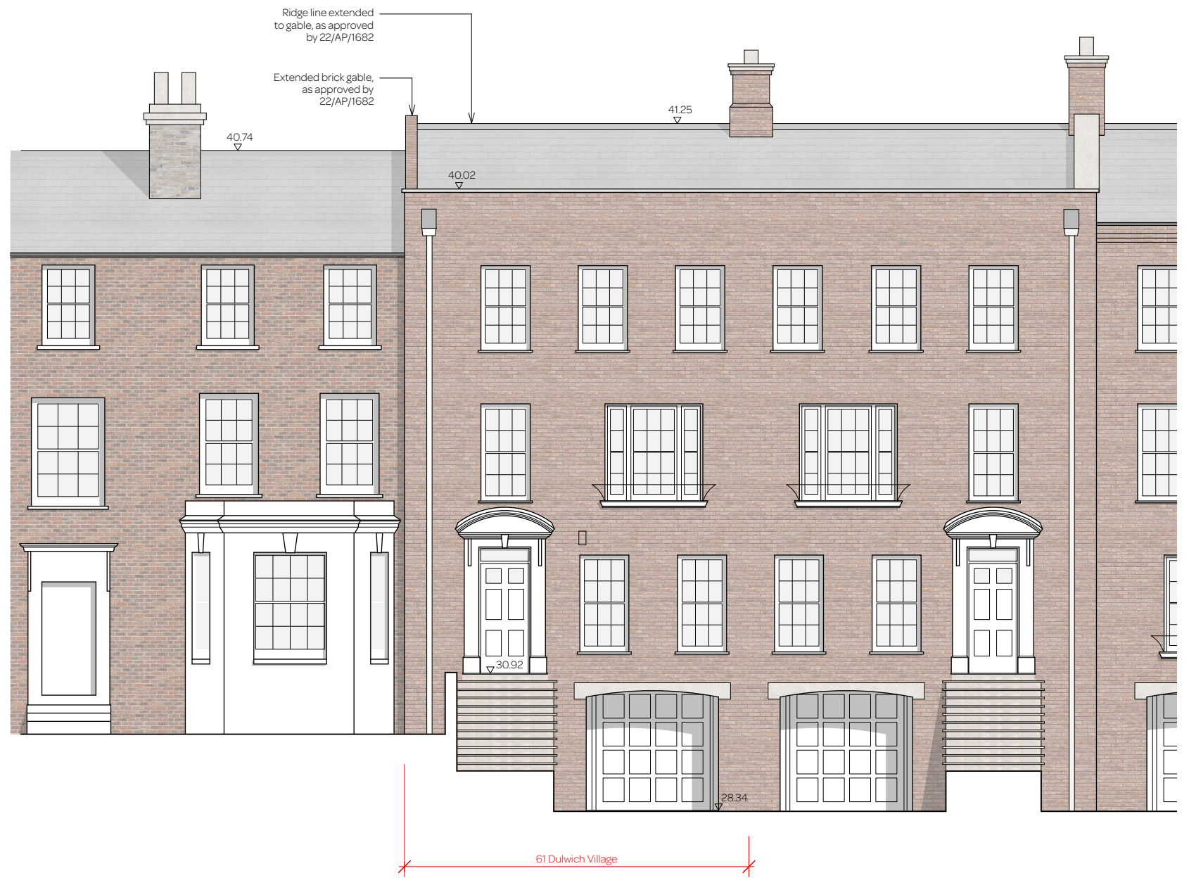
2 Approved Street Elevation

Do not scale off this drawing. All trade contractors to be responsible for taking and checking their own site dimensions. Any errors or omissions to be reported to Stephen Kavanagh Architects immediately, prior to work being carried out. All site dimensions shown are based upon the measured survey of the property, carried out by independent surveyors. The accuracy of this information is not the responsibility of Stephen Kavanagh Architects. Stephen Kavanagh Architects also accept no responsibility for the accuracy of any structural and servicing information shown on this drawing. This information is shown for guidance purposes only, and where applicable is based on information provided by the consulting structural engineers, consulting M&E engineers, client representatives, and/or specialist subcontractors respectively. Reference should always be made to engineers and subcontractors current drawings and specifications. This drawing and design is the copyright of Stephen Kavanagh Architects and is not to be used for any purpose without their consent.