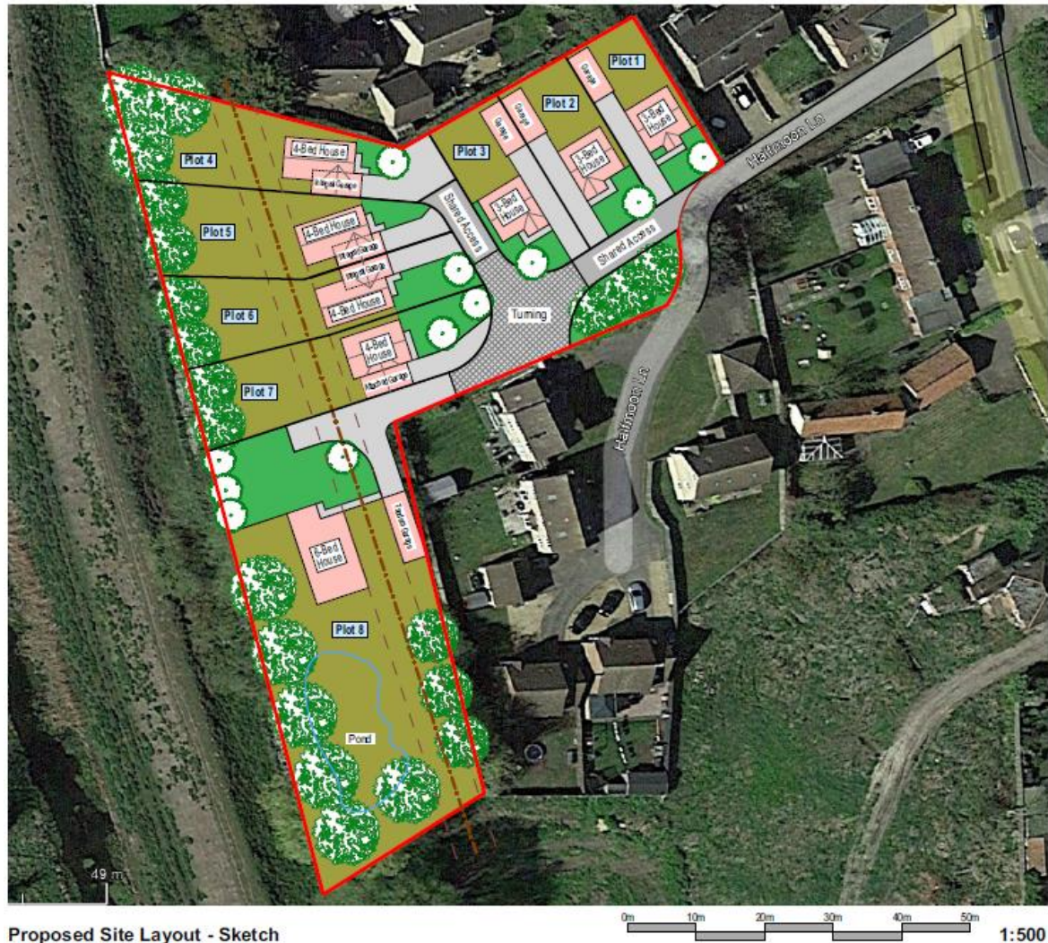
Figure 3: Proposed layout of dwellings

The façade construction of the new buildings would be cavity masonry providing a typical attenuation of R_w 55dB. The overall façade sound attenuation has been calculated according to BS8233:2014 Annexe G2. This method includes a 3dB correction for façade reflection. The free-field spectrum of the noise source was taken from a short period on 12 th April when regular high noise aircraft activity took place.