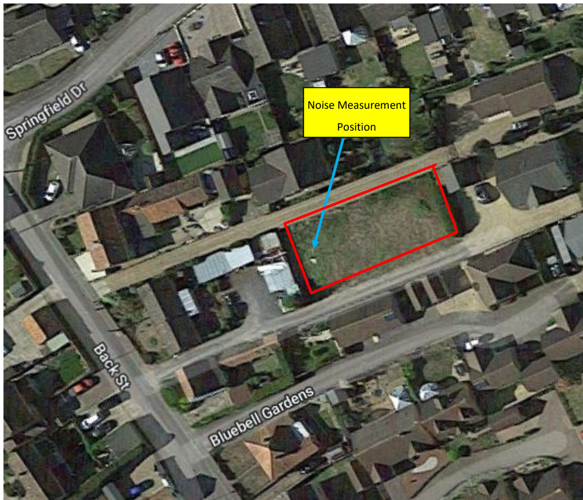
Figure 2: Noise measurement position