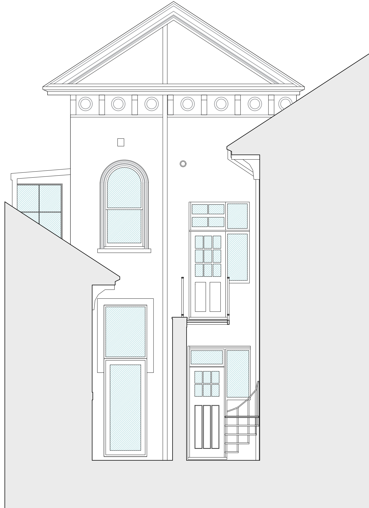
Section BB - Existing - 1:50@A3