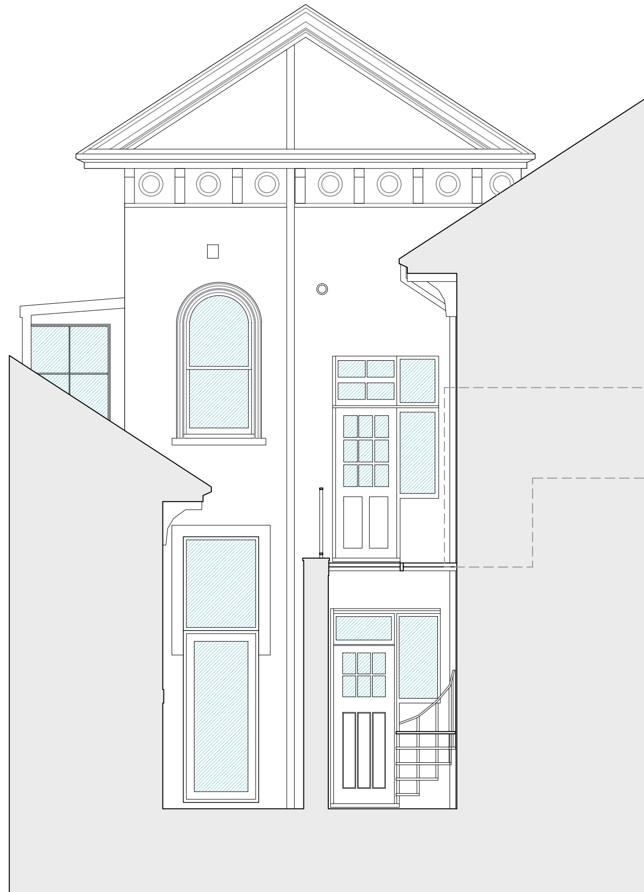
Section BB - Proposed - 1:50@A3

Extension of Black Cast Metal Balcony / Walkway section (to match existing)