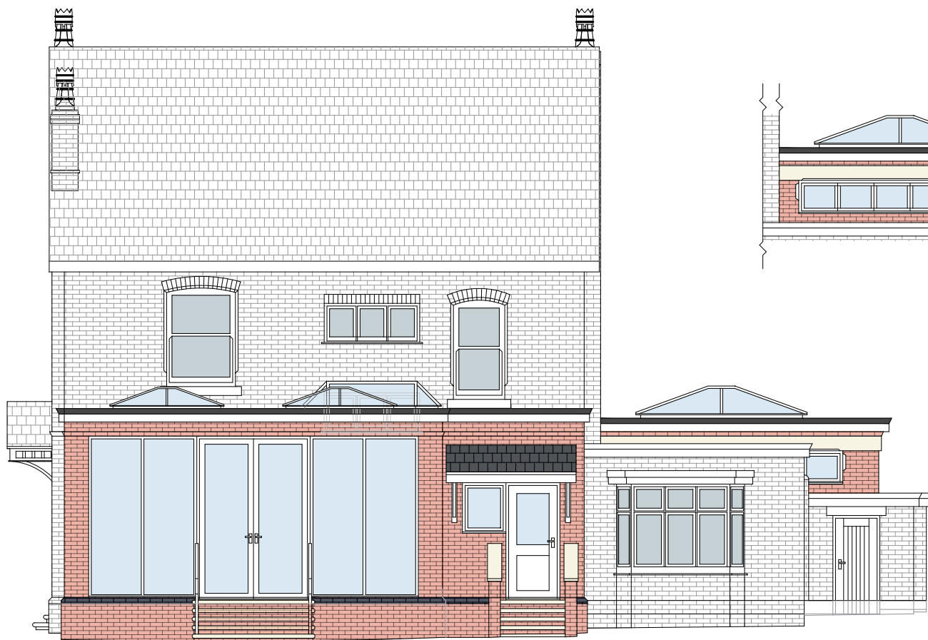
Sun Lounge Rear Wall Detail Scale 1:100