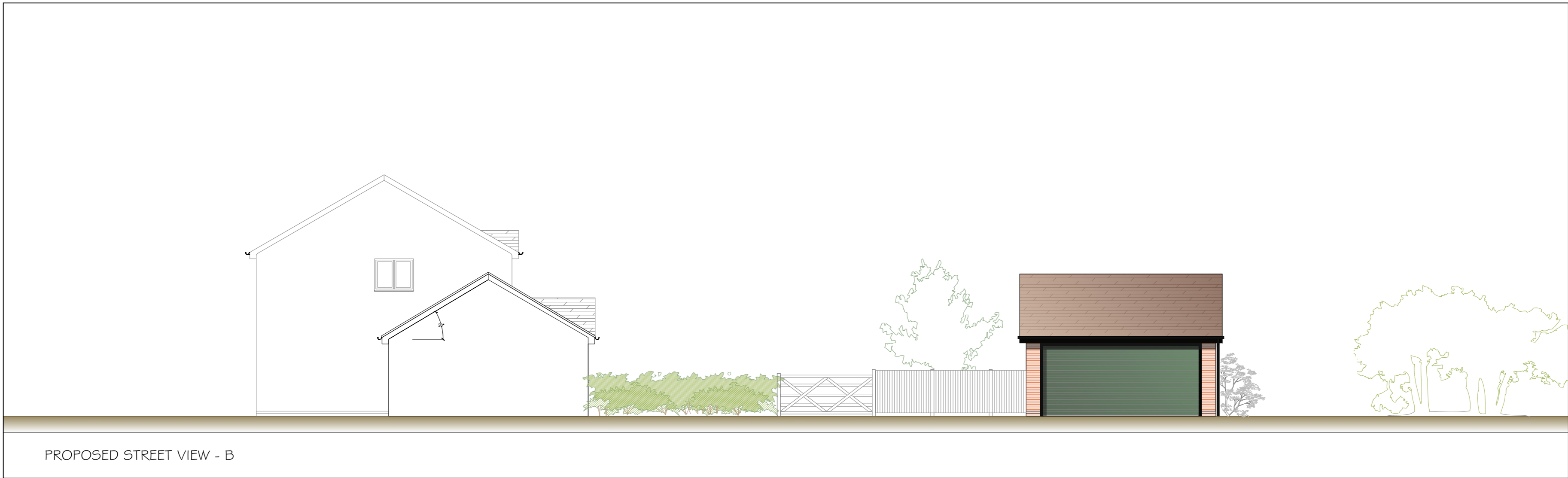
PROPOSED STREET VIEW - B