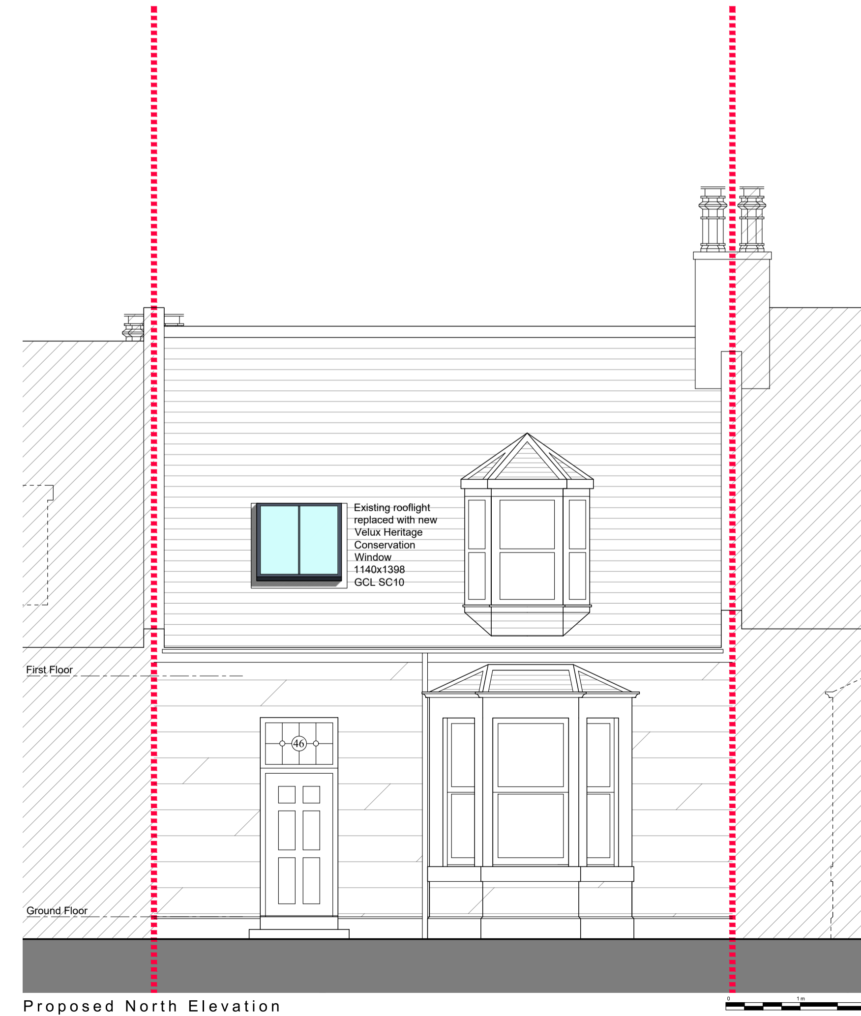
Proposed North Elevation