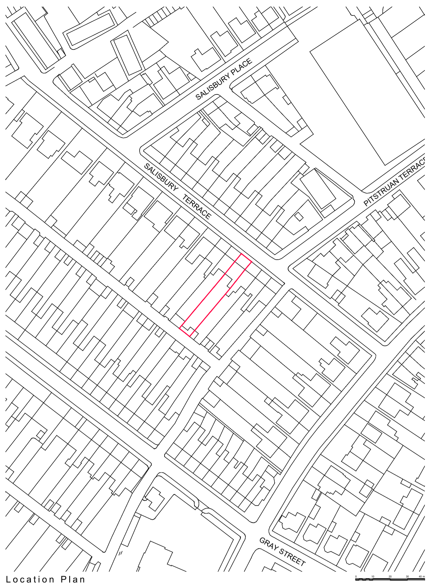
Location Plan Scale 1:1250 on A1