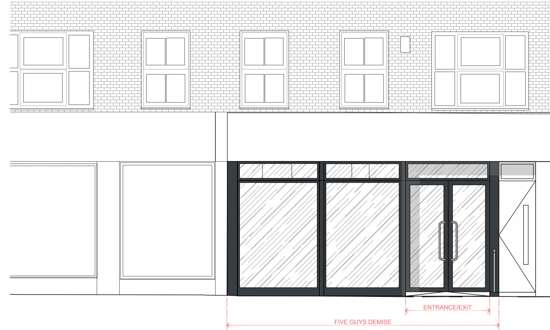
01 SHOPFRONT ELEVATIONS SCALE 1:50 @ A1