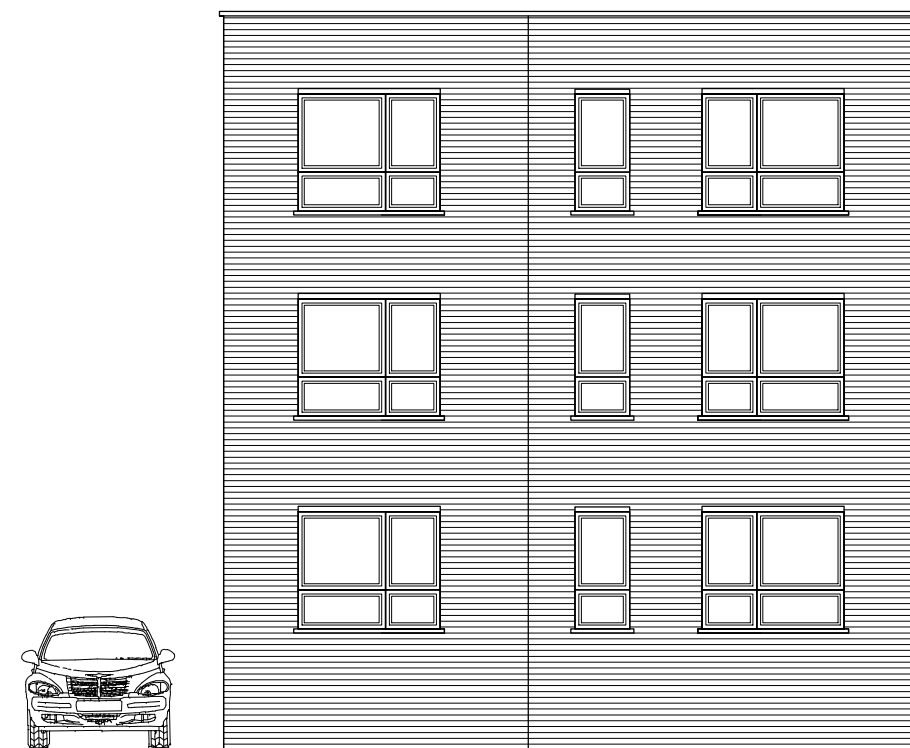
REAR ELEVATION EXISTING