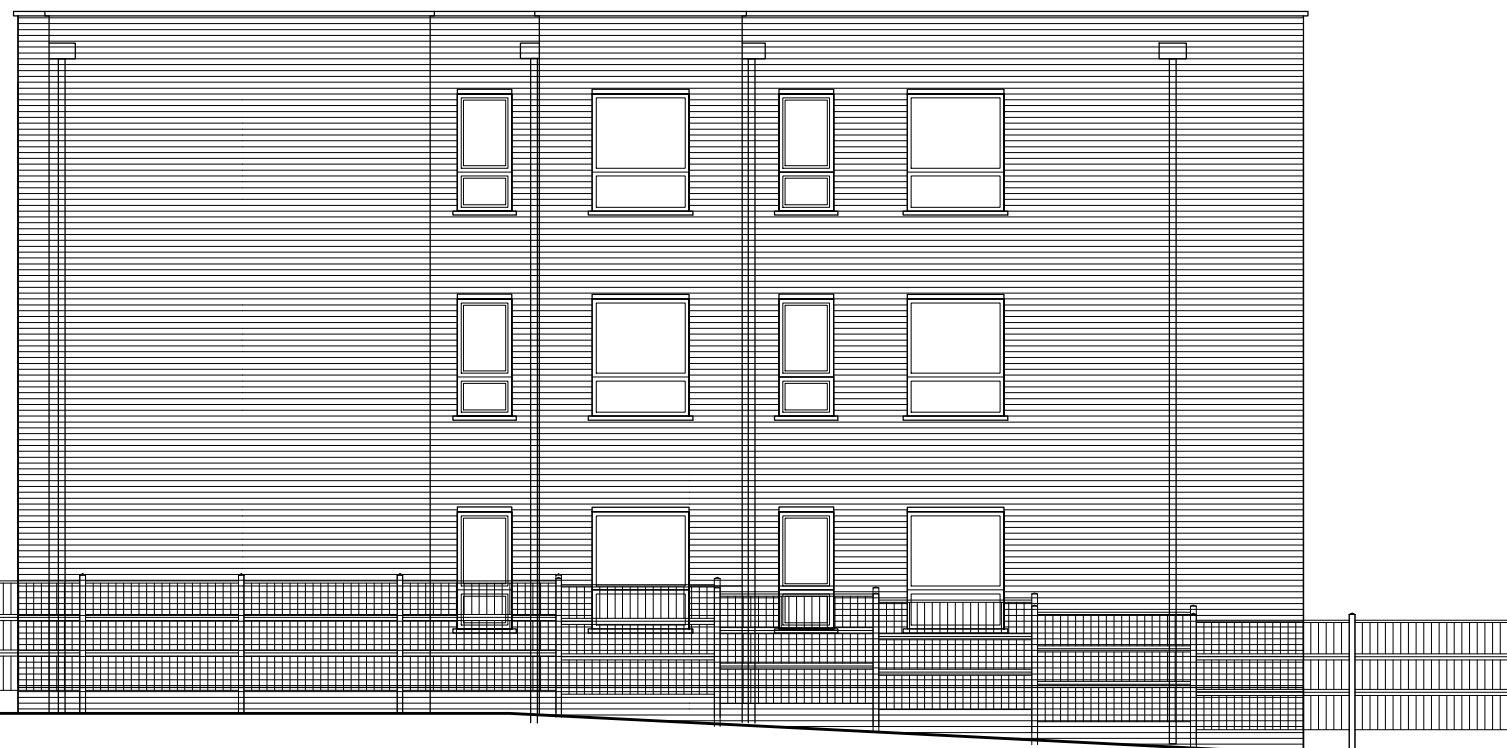
SIDE ELEVATION EXISTING