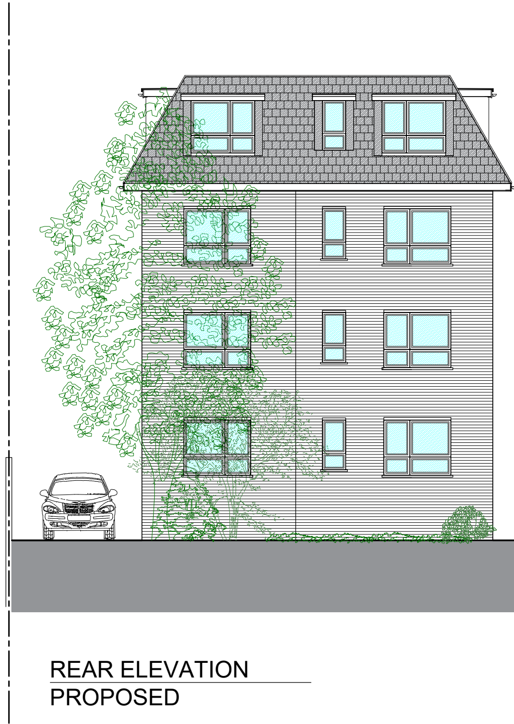
REAR ELEVATION PROPOSED