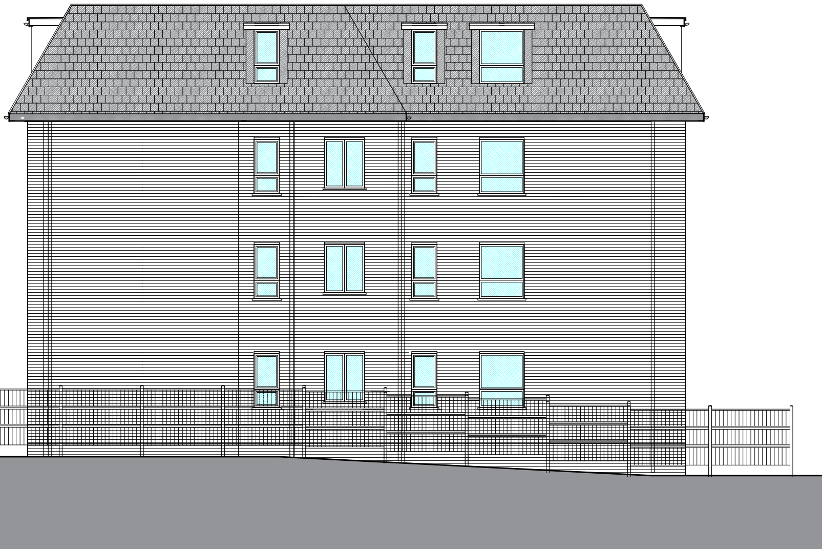
SIDE ELEVATION PROPOSED